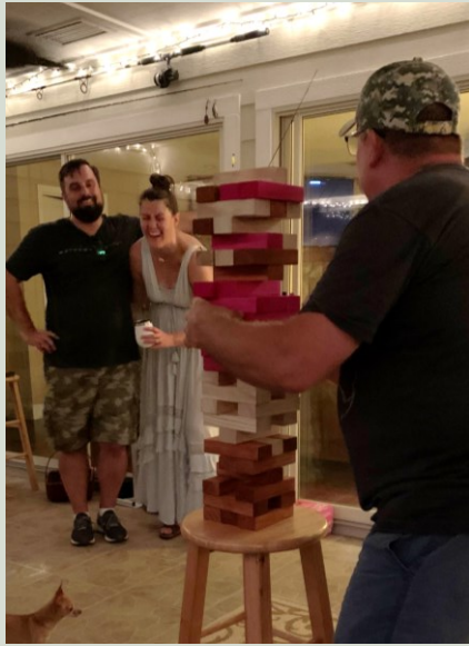
Jenga Masters at work. Escaping the brief rain in the potting shed.