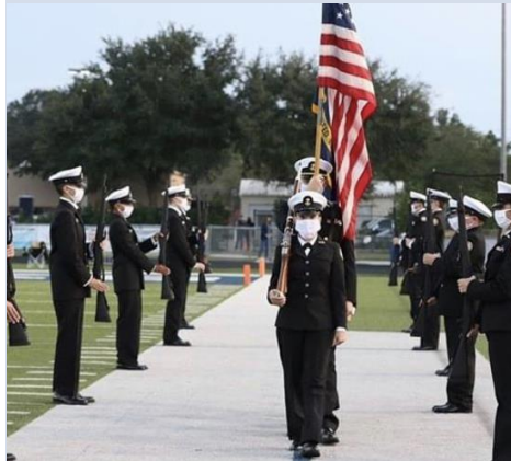
Lake Howell NJROTC

Our Remembrance is May 31 st at 1100 in the Oviedo Cemetery. You will meet the following participants: