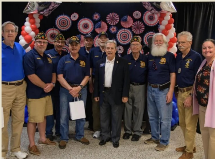
Seminole County outdid themselves again this year at their luncheon honoring local veterans and highlighting our Purple Heart recipients. Post 243 was well represented at the event.