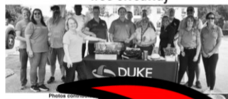
Top picture - Duke Energy volunteers, DeBary Mayor and Council, and DeBary Citizens Academy graduates prepare to hand out trees and giveaways. Bottom right - Mayor Karen Chase gives a tree to a DeBary resident.