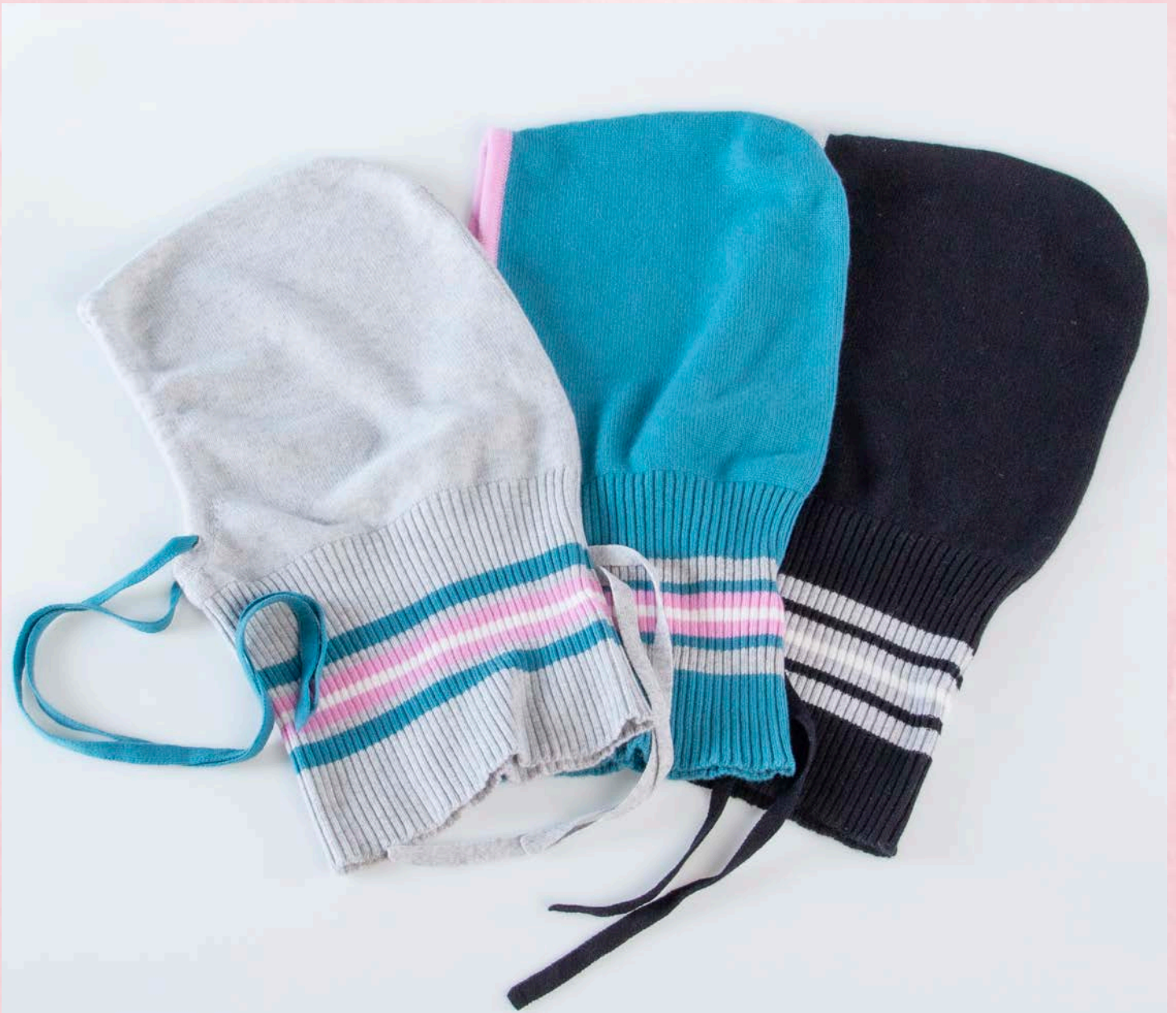
Sara adjustable Cashmere Balaclava with contrast strips 100 % Cashmere Col. Grey melange Col. Teal Col. Black