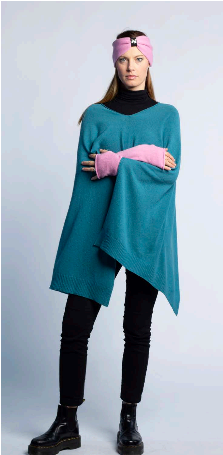
Beatrice cashmere knit over-dress 100% Cashmere Col. Teal