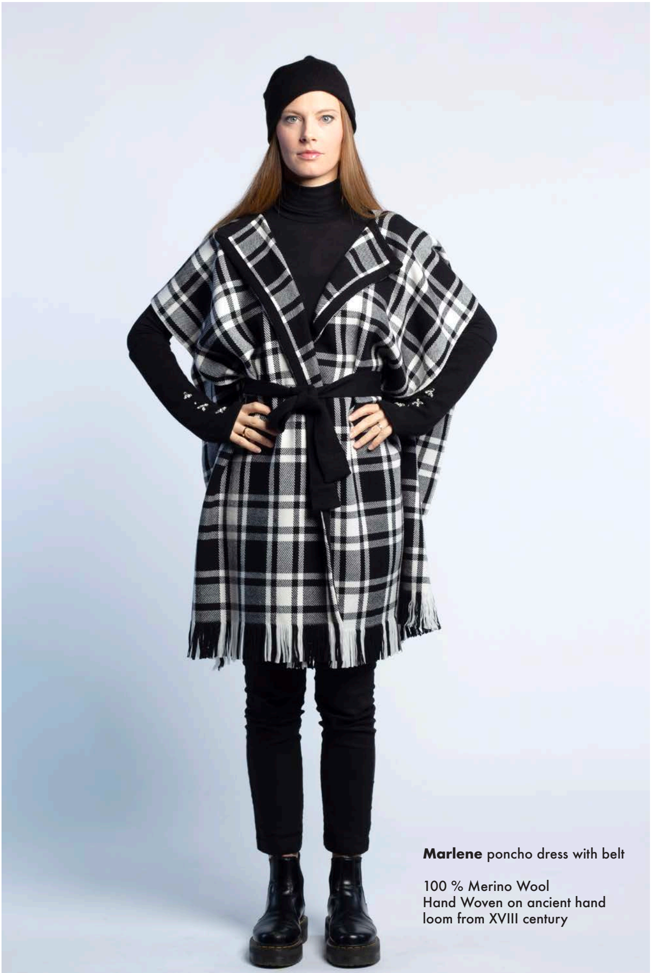
Marlene poncho dress with belt

100 % Merino Wool Hand Woven on ancient hand loom from XVIII century