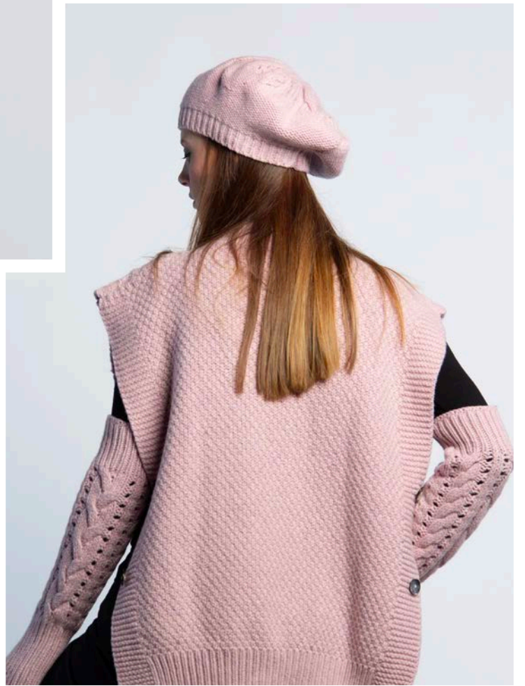
Maribel recycled cashmere sleeves-gloves 97 % Recycled Cashmere 3% Virgin Wool Col. Light Mauve