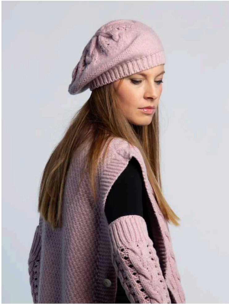
Clarabel recycled cashmere vest 97 % Recycled Cashmere 3% Virgin Wool Col. Light Mauve