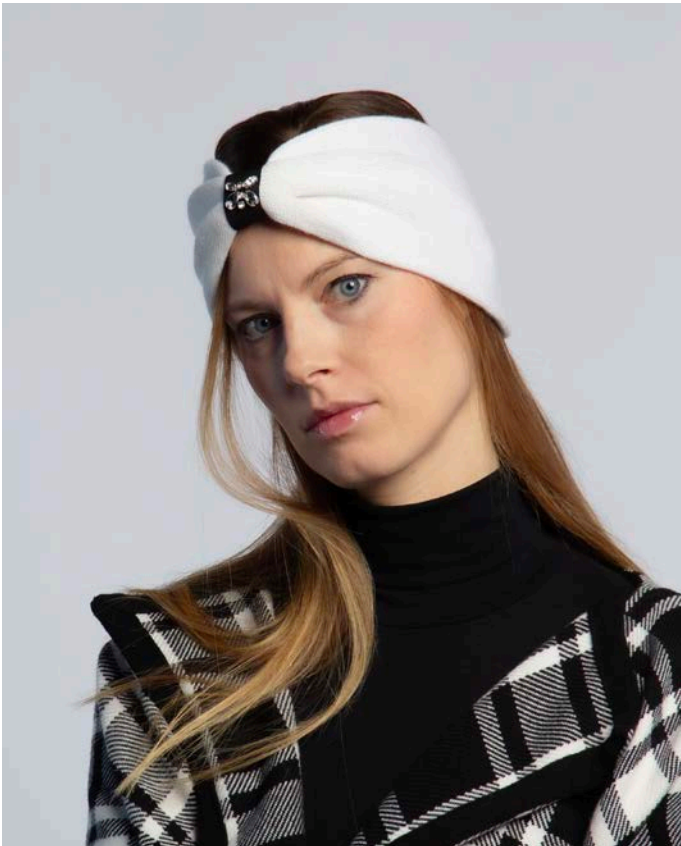
Sofia Cashmere convertible head band & removable crystals bow (on the right) 100 % Cashmere Col. Rosette