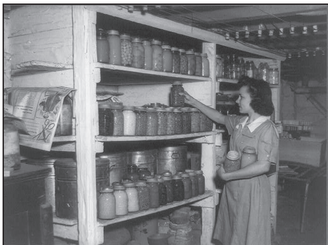
Storing of food grown from garden, 1942.

Root cellars were also used to store items like potatoes and jars of canned foods.