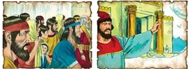
32. 538 B.C

Ezra 1:1 "Now in the first year of Cyrus king of Persia, that the word of the Lord by the mouth of Jeremiah might be fulfilled, the Lord stirred up the spirit of Cyrus king of Persia, so that he made a proclamation throughout all his kingdom, and also put it in writing."