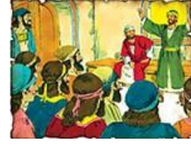
60. 57 A.D.

As God has now taken the Gospel of grace out to the Gentiles through Peter, the Apostle Paul will soon take the Gospel out to the whole world. "Immediately Paul preached the Christ in the synagogues, that He is the Son of God." 21 Then all who heard were amazed, and said, 'Is this not he who destroyed those who called on this name in Jerusalem, and has come here for that purpose, so that he might bring them bound to the chief priests?'" Acts 9:20-21 The Apostle Paul, a few short years later wrote to the church at Rome. The words he wrote have thundered in the ears of those who oppose the name of Jesus and whispered to the hearts of those who seek God, forgiveness, and grace; "But what does it say? 'The word is near you, in your mouth and in your heart' (that is, the word of faith which we preach): 9 that if you confess with your mouth the Lord Jesus and believe in your heart that God has raised Him from the dead, you will be saved. 10 For with the heart one believes unto righteousness, and with the mouth confession is made unto salvation. 11 For the Scripture says, 'Whoever believes on Him will not be put to shame.' 12 For there is no distinction between Jew and Greek, for the same Lord over all is rich to all who call upon Him. 13 For 'whoever calls on the name of the LORD shall be saved.'" Romans 10:8-13