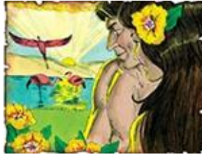
2. Before 4000 B.C.