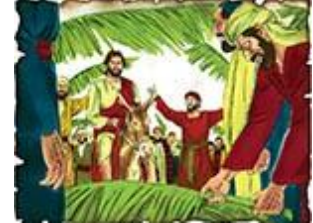
45. 30 A.D.

As Jesus prepares to go to the cross as He often does Jesus goes into a time of deep prayer and intercession with God the Father. During this time Jesus prays for all who believe in Him and in His mission and purpose that God would protect us from evil and to sanctify and strengthen us. I have given them Your word; and the world has hated them because they are not of the world, just as I am not of the world. 15 I do not pray that You should take them out of the world, but that You should keep them from the evil one. 16 They are not of the world, just as I am not of the world. 17 Sanctify them by Your truth. Your word is truth. 18 As You sent Me into the world, I also have sent them into the world. John 17:14-18