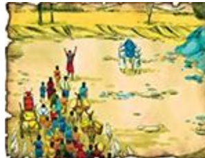
17. 1405 B.C

Joshua 1:1-3 "After the death of Moses the servant of the Lord, it came to pass that the Lord spoke to Joshua the son of Nun, Moses' assistant, saying: 2 'Moses My servant is dead. Now therefore, arise, go over this Jordan, you and all this people, to the land which I am giving to them—the children of Israel. 3 Every place that the sole of your foot will tread upon I have given you, as I aid to Moses.'"