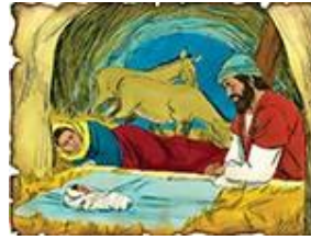
35. 4 B.C

Luke 2:11-12 "For there is born to you this day in the city of David a Savior, who is Christ the Lord. 12 And this will be the sign to you: You will find a Babe wrapped in swaddling cloths, lying in a manger."