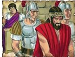
26. 711 B.C.