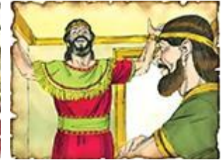
21. 1010 B.C.

God continues to expand the territory the nation of Israel occupies, based on His promise to Abraham, Isaac and Jacob through a series of Judges that ruled Israel. The nation reaches an apex of power through the leadership of Judge Gideon and then begins to slip back into sin. There are a total of twelve Judges for a period of over three hundred years. God then calls a young boy names Samuel at a very early age to become His prophet to the nation. And the LORD called Samuel again the third time. So he arose and went to Eli, and said, 'Here I am, for you did call me. Then Eli perceived that the LORD had called the boy. 9 Therefore Eli said to Samuel, "Go, lie down; and it shall be, if He calls you, that you must say, 'Speak, LORD, for Your servant hears.'" So Samuel went and lay down in his place. 10 Now the LORD came and stood and called as at other times, 'Samuel! Samuel!' And Samuel answered, 'Speak, for Your servant hears.' 19 So Samuel grew, and the LORD was with him and let none of his words fall to the ground. 20 And all Israel from Dan to Beersheba knew that Samuel had been established as a prophet of the LORD. 21 Then the LORD appeared again in Shiloh. For the LORD revealed Himself to Samuel in Shiloh by the word of the LORD. I Samuel 3:8-10,19-20