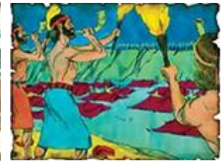
9. 1190 B.C.

As the nation of Israel nears the Promised Land the promise God first made to Abraham is about to be fulfilled. "I will establish My covenant between Me and you and your descendants after you in their generations, for an everlasting covenant, to be God to you and your descendants after you. 8 Also I give to you and your descendants after you the land in which you are a stranger, all the land of Canaan, as an everlasting possession; and I will be their God." Genesis 17:7-8 The promise that God would give the land to Abraham and his descendents to establish an everlasting covenant with His people, is moving closer to fulfillment. The promise made to Adam and Eve in Genesis 3 that a Redeemer or the Messiah would come not only to crush Satan but to free mankind from the penalty of sin and separation from God. And I will put enmity between you and the woman, and between your seed and her seed; He shall bruise your head, and you shall bruise His heel." Genesis 3:15