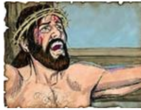
49. 30 A.D.

John 19:30 “So when Jesus had received the sour wine, He said, ‘It is finished!’ And bowing His head, He gave up His spirit.”