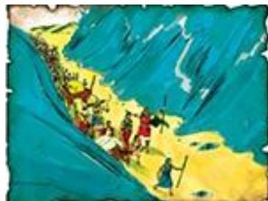
14. 1446 B.C.

Exodus 14:21 "Then Moses stretched out his hand over the sea; and the Lord caused the sea to go back by a strong east wind all that night, and made the sea into dry land, and the waters were divided."