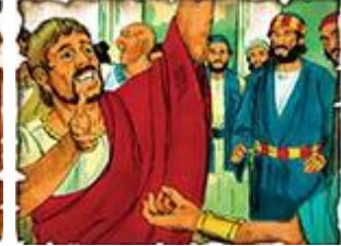
457. 37 A.D.