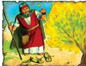
12. 1446 B.C

Exodus 3:2-4 "And the Angel of the Lord appeared to Moses in a flame of fire from the midst of a bush. So he looked, and behold, the bush was burning with fire, but the bush was not consumed. 3 Then Moses said, 'I will now turn aside and see this great sight, why the bush does not burn.' 4 So when the Lord saw that he turned aside to look, God called to him from the midst of the bush and said, 'Moses, Moses!' And he said, 'Here I am.'"