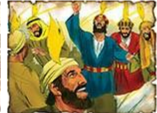
54. 30 A.D.

Jesus spent considerable time with His closest disciples, encouraging and strengthening before He gave them the great commission that would change the world! "And Jesus came and spoke to them, saying, 'All authority has been given to Me in heaven and on earth. 19 Go therefore and make disciples of all the nations, baptizing them in the name of the Father and of the Son and of the Holy Spirit, 20 teaching them to observe all things that I have commanded you; and lo, I am with you always, even to the end of the age.'" Amen. Matthew 28:18-20 As the time was drawing near for Jesus to ascend back to His Father in heaven He spent forty days teaching His disciples about the kingdom of God. "The former account I made, O Theophilus, of all that Jesus began both to do and teach, 2 until the day in which He was taken up, after He through the Holy Spirit had given commandments to the apostles whom He had chosen, 3 to whom He also presented Himself alive after His suffering by many infallible proofs, being seen by them during forty days and speaking of the things pertaining to the kingdom of God." Acts 1:1-3