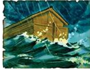
5. 4000 B.C.

Genesis 6:5 "Then the Lord saw that the wickedness of man was great in the earth, and that every intent of the thoughts of his heart was only evil continually."