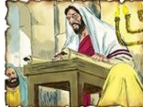
37. 27 A.D

Luke 4:18-19 "The Spirit of the Lord is upon Me, Because He has anointed Me To preach the gospel to the poor; He has sent Me to heal the brokenhearted, To proclaim liberty to the captives And recovery of sight to the blind, To set at liberty those who are oppressed; 19 To proclaim the acceptable year of the Lord."