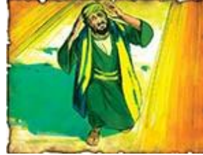
56. 34 A.D.