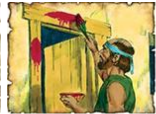
13. 1446 B.C.

God gives Joseph a long life of over one hundred years and his brothers and their families live in Egypt in relative safety. "And Joseph said to his brethren, 'I am dying; but God will surely visit you, and bring you out of this land to the land of which He swore to Abraham, to Isaac, and to Jacob.' 25 Then Joseph took an oath from the children of Israel, saying, 'God will surely visit you, and you shall carry up my bones from here.' 26 So Joseph died, being one hundred and ten years old; and they embalmed him, and he was put in a coffin in Egypt." Genesis 50:24-26 Then after a few years things changed for God's people. "Now there arose a new king over Egypt, who did not know Joseph. 9 And he said to his people, 'Look, the people of the children of Israel are more and mightier than we; 10 come, let us deal shrewdly with them, lest they multiply, and it happen, in the event of war, that they also join our enemies and fight against us, and so go up out of the land.' 11 Therefore they set taskmasters over them to afflict them with their burdens. And they built for Pharaoh supply cities, Pithom and Raamses." Exodus 1:8-11