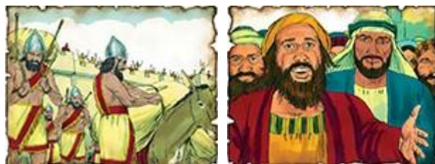
29. 586 B.C

Jeremiah 25:11 And this whole land shall be a desolation and an astonishment, and these nations shall serve the king of Babylon seventy years.