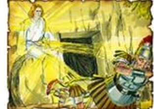
50. 30 A.D.

God’s long awaited promise of redemption is about to be completed on a lonely hill outside Jerusalem called Golgotha or Calvary. “And He, bearing His cross, went out to a place called the Place of a Skull, which is called in Hebrew, Golgotha, 18 where they crucified Him, and two others with Him, one on either side, and Jesus in the center. 19 Now Pilate wrote a title and put it on the cross. And the writing was: JESUS OF NAZARETH, THE KING OF THE JEWS.” John 19:17-19