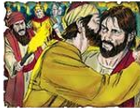
47. 30 A.D.