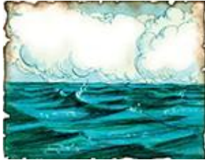
1. Before 4000 B.C.

Genesis 1: "In the beginning God created the heavens and the earth"