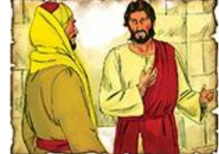
38. 27 A.D.

After Jesus had been baptized by John the Baptist, God's presence in the person of the Trinity, three persons in one God, is manifested. "When all the people were baptized, it came to pass that Jesus also was baptized; and while He prayed, the heaven was opened. 22 And the Holy Spirit descended in bodily form like a dove upon Him, and a voice came from heaven which said, "You are My beloved Son; in You I am well pleased." Luke 3:21-22 Jesus then goes into the desert, where He is tempted by Satan for forty days. "Then Jesus, being filled with the Holy Spirit, returned from the Jordan and was led by the Spirit into the wilderness, 2 being tempted for forty days by the devil. And in those days He ate nothing, and afterward, when they had ended, He was hungry." Luke 4:1-2