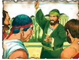
58. 57 A.D.

Romans 10:9 "That if you confess with your mouth the Lord Jesus and believe in your heart that God has raised Him from the dead, you will be saved."