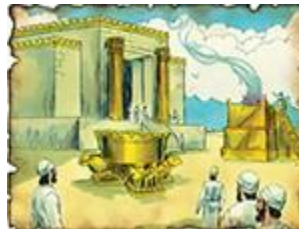
23. 966 B.C