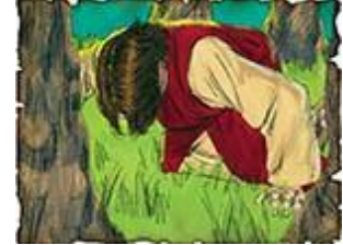
48. 30 A.D.

The time is drawing near for the completion of God’s promise of redemption, Jesus’ death on the cross as predicted by Isaiah 711 years before Jesus was born. “But He was wounded for our transgressions, He was bruised for our iniquities; The chastisement for our peace was upon Him, And by His stripes we are healed. All we like sheep have gone astray; we have turned, every one, to his own way; and the LORD has laid on Him the iniquity of us all.” Isaiah 53:5-6 Jesus gathers with His disciples for the traditional Passover meal, celebrated since the first Passover from Egypt fourteen hundred years prior to this time. The Old Covenant of an innocent lamb as an animal sacrifice for the payment of sin is about to be replaced by the sacrifice of God’s sinless lamb, Jesus on the cross for our sins. This is what Jesus came to do, to fulfill God’s will. The first Passover from Egypt involved marking the doorposts with the blood of a lamb to protect the families in the home from the angel of death. “And you shall take a bunch of hyssop, dip it in the blood that is in the basin, and strike the lintel and the two doorposts with the blood that is in the basin. And none of you shall go out of the door of his house until morning.” 23 For the LORD will pass through to strike the Egyptians; and when He sees the blood on the lintel and on the two doorposts, the LORD will pass over the door and not allow the destroyer to come into your houses to strike you.” Exodus 12:22-23