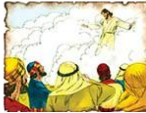
53. 30 A.D.