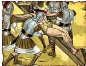
22. 1000 B.C.

Psalm 22:16-18 For dogs have surrounded Me; the congregation of the wicked has enclosed Me. They pierced My hands and My feet; 17 I can count all My bones. They look and stare at Me. 18 They divide My garments among them, and for My clothing they cast lots.