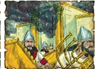
28. 586 B.C.

Isaiah was a prophet called by God to warn the nation of Israel of the danger of falling away from God and serving other gods. He served God as a prophet for over sixty-five years around 760 BC to 675 BC. His writings, inspired by the Holy Spirit, predicted the coming of God's promised Redeemer in a time to come in the future. I, the LORD, have called You in righteousness, and will hold Your hand; I will keep You and give You as a covenant to the people, as a light to the Gentiles, 7 to open blind eyes, to bring out prisoners from the prison, those who sit in darkness from the prison house. Isaiah 42:6-7