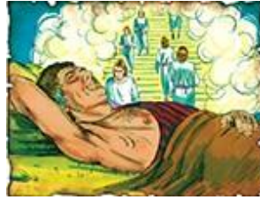
8. 1990 B.C

Genesis 28:12 "Then Jacob dreamed, and behold, a ladder was set up on the earth, and its top reached to heaven; and there the angels of God were ascending and descending on it."