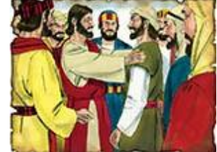
42. 30 A.D.

Jesus continues to preach the gospel of the kingdom of God and the importance of repentance and turning back to God. The outcasts of society come to hear Him, while the religious leaders continue to despise Him. In one of the parables Jesus uses the analogy of a shepherd familiar to the Jewish people that King David wrote about in the beloved Psalm 23 around 1000 BC. "The LORD is my shepherd; I shall not want. 2 He makes me to lie down in green pastures; He leads me beside the still waters. 3 He restores my soul; He leads me in the paths of righteousness For His name's sake." Psalm 23:1-3 Jesus begins to teach about God's love for the lost using a story about a shepherd and his sheep "Then all the tax collectors and the sinners drew near to Him to hear Him. 2 And the Pharisees and scribes complained, saying, 'This Man receives sinners and eats with them.' 3 So He spoke this parable to them, saying: 4 'What man of you, having a hundred sheep, if he loses one of them, does not leave the ninety-nine in the wilderness, and go after the one which is lost until he finds it? 5 And when he has found it, he lays it on his shoulders, rejoicing. 6 And when he comes home, he calls together his friends and neighbors, saying to them, "Rejoice with me, for I have found my sheep which was lost!" 7 I say to you that likewise there will be more joy in heaven over one sinner who repents than over ninety-nine just persons who need no repentance.'" Luke 15:1-7