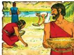
15. 1446 B.C