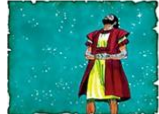
6. 2091 B.C.

Adam and Eve had many children and the world's population continued to grow. In time mankind consistently chose sin over obeying God and the evil on the earth grew worse. "And the LORD was sorry that He had made man on the earth, and He was grieved in His heart. 7 So the LORD said, 'I will destroy man whom I have created from the face of the earth, both man and beast, creeping thing and birds of the air, for I am sorry that I have made them.'" Genesis 6:6-7 In order for God's promise of redemption to be fulfilled toward mankind, someone had to survive this great flood that was sent around 3500 B.C. "But Noah found grace in the eyes of the LORD." God then re-establishes His promise of redemption and covenant with Noah and his sons. "And behold, I Myself am bringing floodwaters on the earth, to destroy from under heaven all flesh in which is the breath of life; everything that is on the earth shall die. 18 But I will establish My covenant with you; and you shall go into the ark—you, your sons, your wife, and your sons' wives with you." Genesis 6:17-18