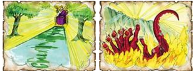
66. 2015 A.D.?

Revelation 20:2-3 "He laid hold of the dragon, that serpent of old, who is the Devil and Satan, and bound him for a thousand years; 3 and he cast him into the bottomless pit, and shut him up, and set a seal on him, so that he should deceive the nations no more till the thousand years were finished."