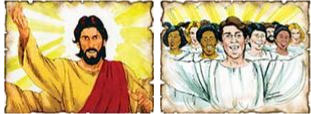
68. 2015 A.D.?

Revelation 21:4 "And God will wipe away every tear from their eyes; there shall be no more death, nor sorrow, nor crying. There shall be no more pain, for the former things have passed away."