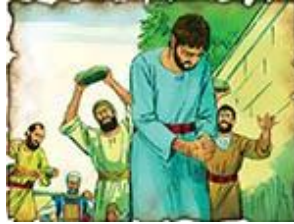
55. 31 A.D.

Acts 7:58-59 "And they cast Steven out of the city and stoned him. And the witnesses laid down their clothes at the feet of a young man named Saul. 59 And they stoned Stephen as he was calling on God and saying, 'Lord Jesus, receive my spirit.'"