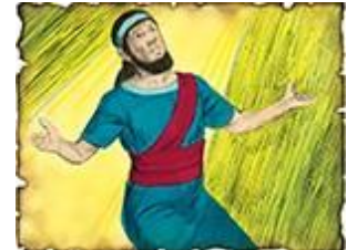
31. 539 B.C.

Daniel 9:24-25 Seventy weeks are determined for your people and for your holy city, to finish the transgression, to make an end of sins, to make reconciliation for iniquity, to bring in everlasting righteousness, to seal up vision and prophecy, and to anoint the Most Holy. 25 Know therefore and understand, that from the going forth of the command to restore and build Jerusalem until Messiah the Prince, there shall be seven weeks and sixty-two weeks; the street shall be built again, and the wall, even in troublesome times.