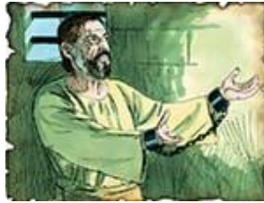
61. 67 A.D.

2 Timothy 4:6 "For I am now ready to be offered, and the time of my departure is at hand. 7 I have fought a good fight, I have finished my course, I have kept the faith"