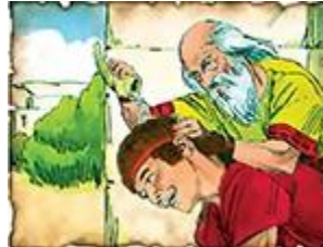
20. 1010 B.C