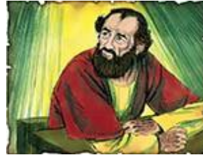
62. 67 A.D.