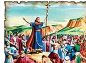
16. 1410 B.C.

As the nation of Israel fled the Egyptian army, God protected them while this large mass of people were alone in the desert. "And the Angel of God, who went before the camp of Israel, moved and went behind them; and the pillar of cloud went from before them and stood behind them. 20 So it came between the camp of the Egyptians and the camp of Israel. Thus it was a cloud and darkness to the one, and it gave light by night to the other, so that the one did not come near the other all that night." Exodus 14:19-20 Then without lifting a weapon, God did what only God could do, He defeated the elite of the Egyptian army. "So the children of Israel went into the midst of the sea on the dry ground, and the waters were a wall to them on their right hand and on their left. 23 And the Egyptians pursued and went after them into the midst of the sea, all twenty-seven horses, his chariots, and his horsemen. 24 Now it came to pass, in the morning watch, that the LORD looked down upon the army of the Egyptians through the pillar of fire and cloud, and He troubled the army of the Egyptians. 25 And He took off their chariot wheels, so that they drove them with difficulty; and the Egyptians said, 'Let us flee from the face of Israel, for the LORD fights for them against the Egyptians.'" Exodus 14:22-25