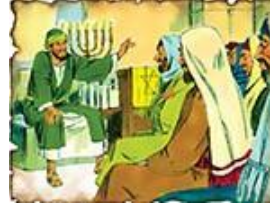
59. 57 A.D.