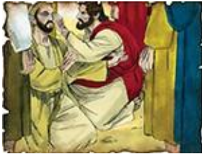
25. 711 B.C.

Isaiah 42:6-7 I, the Lord, have called You in righteousness, and will hold Your hand; I will keep You and give You as a covenant to the people, as a light to the Gentiles, 7 to open blind eyes, to bring out prisoners from the prison, those who sit in darkness from the prison house.