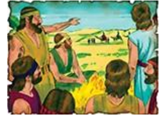
9. 1898 B.C.

God continues the covenant He made with Abraham and then his son Isaac. "Then the LORD appeared to Isaac and said: 'Do not go down to Egypt; live in the land of which I shall tell you. 3 Dwell in this land, and I will be with you and bless you; for to you and your descendants I give all these lands, and I will perform the oath which I swore to Abraham your father. 4 And I will make your descendants multiply as the stars of heaven; I will give to your descendants all these lands; and in your seed all the nations of the earth shall be blessed; 5 because Abraham obeyed My voice and kept My charge, My commandments, My statutes, and My laws.'" Genesis 26:2-5