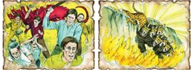
64. 2015 A.D.?

Revelation 13:8-9 "All who dwell on the earth will worship him, whose names have not been written in the Book of Life of the Lamb slain from the foundation of the world. 9 If anyone has an ear, let him hear."