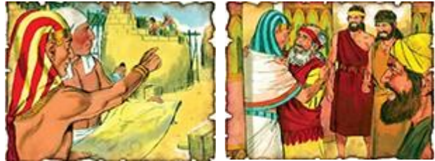
10. 1886 B.C

Genesis 41:38-40 “And Pharaoh said to his servants, ‘Can we find such a one as this, a man in whom is the Spirit of God?’ 39 Then Pharaoh said to Joseph, ‘Inasmuch as God has shown you all this, there is no one as discerning and wise as you.’ 40 You shall be over my house, and all my people shall be ruled according to your word; only in regard to the throne will I be greater than you.’