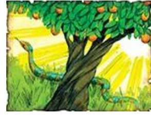
4. Before 4000 B.C.

It has been said that these ten words in the Bible are the most important in the entire Bible. If you can believe that God created everything out of the word of His mouth by faith, you can believe the rest of the Bible. "In the beginning God created the heavens and the earth. 2 The earth was without form, and void; and darkness was on the face of the deep. And the Spirit of God was hovering over the face of the waters." Genesis 1:1-2 It is believed that this event occurred around 6,000–10,000 years ago, while some believe even longer because of the theory of evolution. The key point is that God created all things.