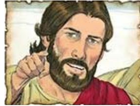
41. 30 A.D.