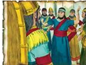
27. 604 B.C.