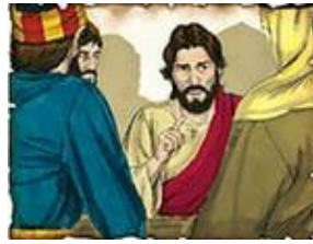
44. 30 A.D