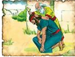
19. 1018 B.C.

I Samuel 16:10 But the Lord said to Samuel, "Do not look at his appearance or at his physical stature, because I have refused him. For the Lord does not see as man sees; for man looks at the outward appearance, but the Lord looks at the heart."