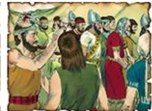
24. 722 B.C.