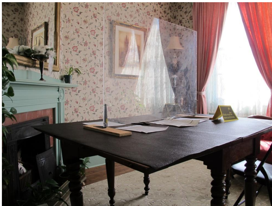
Officiants stand behind a plastic screen during the ceremony.