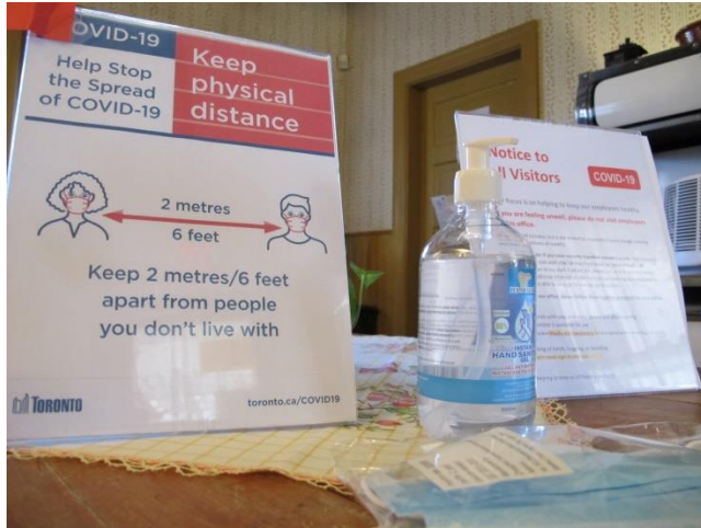
Hand sanitizer and masks at the entrance.

they are everywhere these days. Air filters, ventilation, plastic barriers, and disinfection of high-touch surfaces are all employed to further reduce the risk of transmission, and the number of people allowed inside is limited.