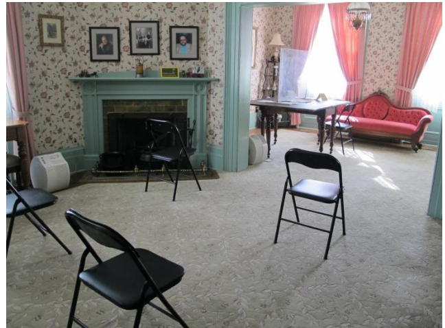
Guests keep their distance during weddings.