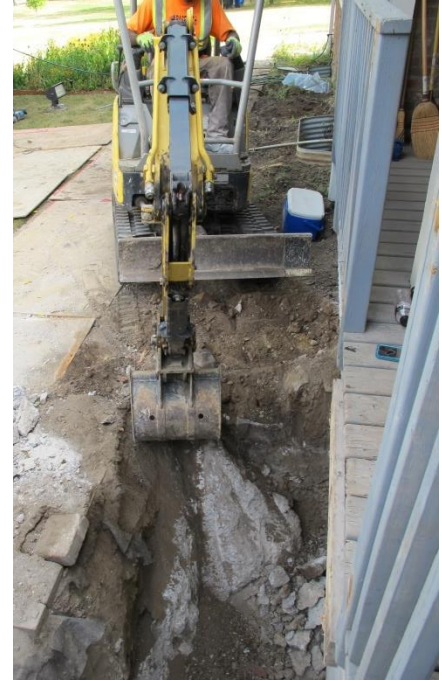
Basement waterproofing and drainage work, Aug 2021.

Other maintenance projects during COVID were tackled by property-manager Terry, including refurbishment and painting of all the storm windows, and a makeover of the front porch, whose original pillars were badly in need of re-lamination and painting. Oh, and did I mention a major tidy-up of the basement storage areas while the house was all quiet below stairs?