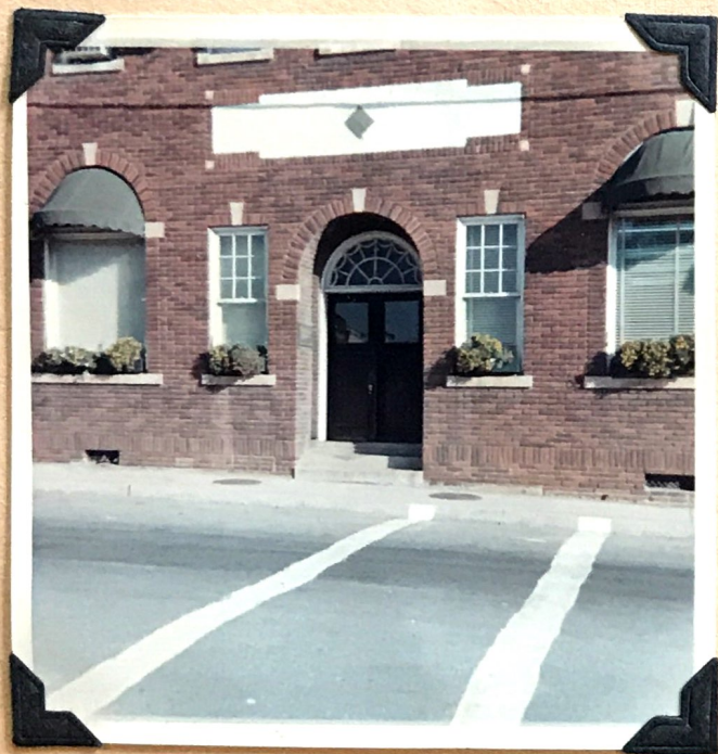
Window boxes at Mill Office Building N. Main Street