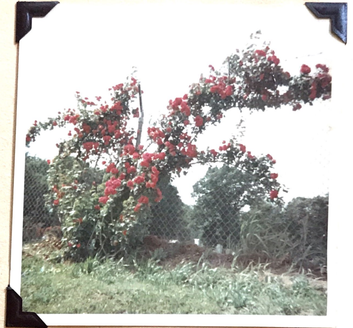
Roses at Central School