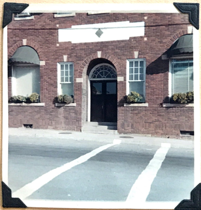
Window boxes at Mill Office Building N. Main Street