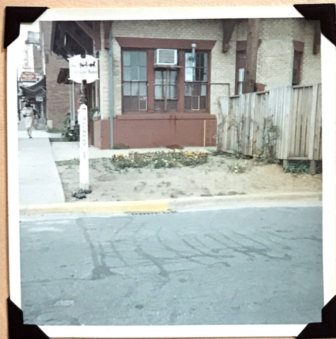
Pansy bed at Carriage House