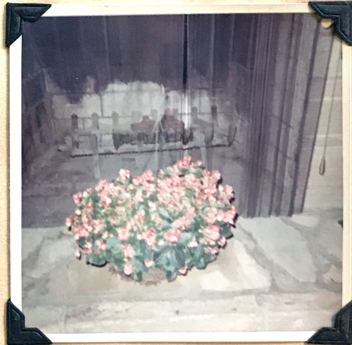
Hanging baskets for plant sale Begonia