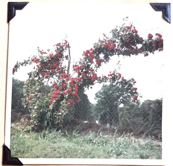
Roses at Central School