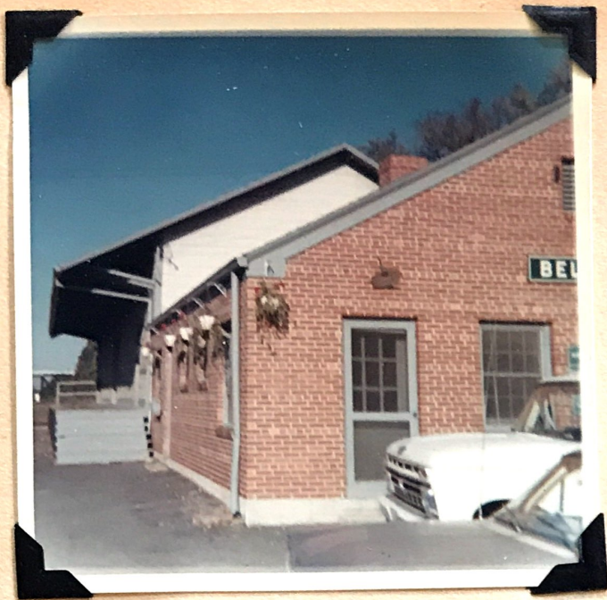
Hanging baskets Southern Railway Depot