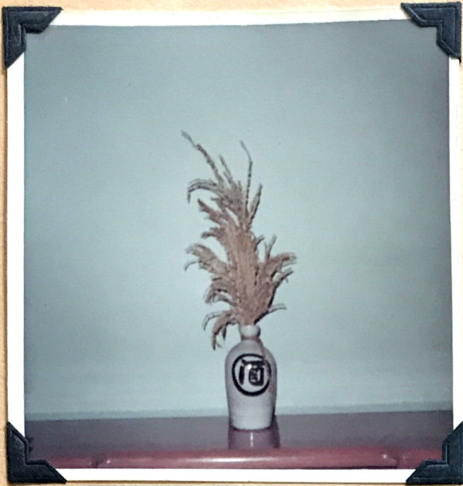
Dried corn stalk tops Clara Bullard