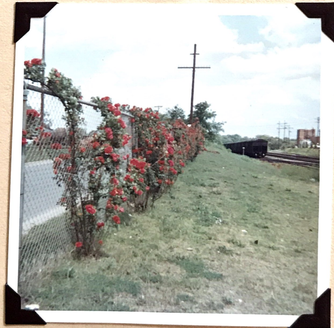
Roses on railroad fence