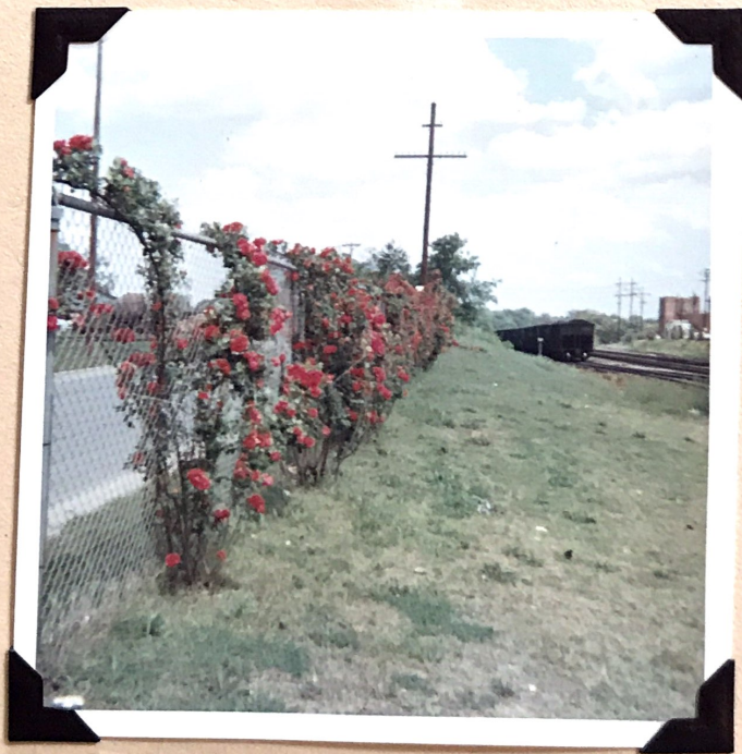
Roses on railroad fence