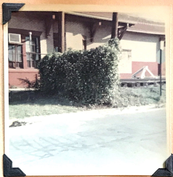
Morning-Glory on fence N. Main Street