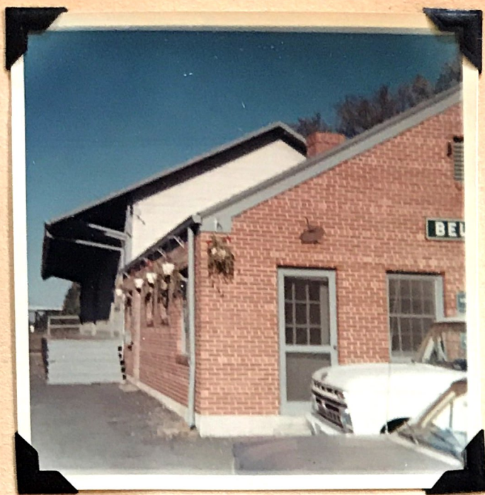
Hanging baskets Southern Railway Depot