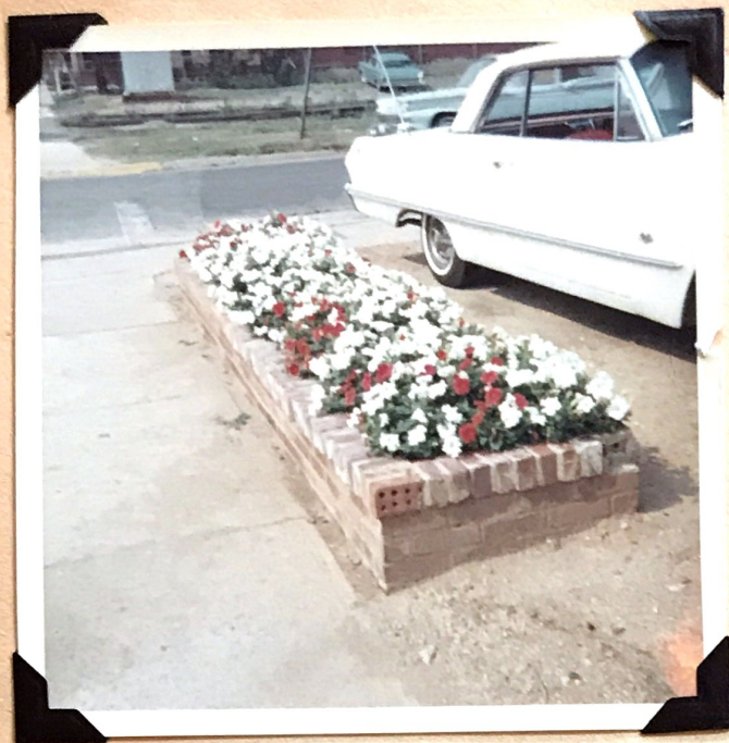
Planter at Ostwalt's