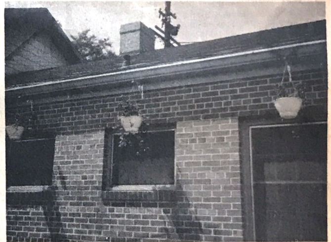
The hanging baskets at the Railway Station.