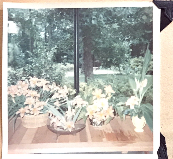
Daylillies in basket Mildred Ford