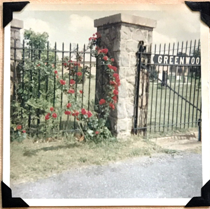
Roses at cemetary entrance