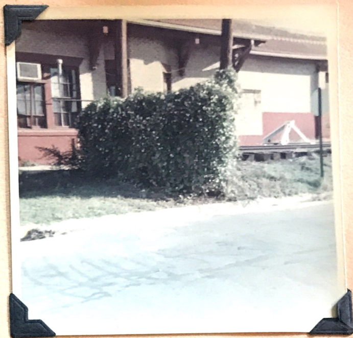
Morning-Glory on fence N. Main Street