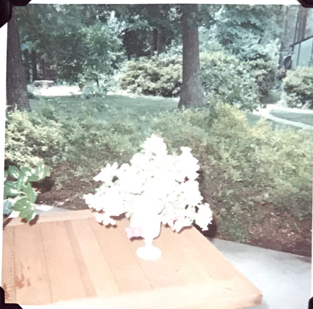
Magnolias in brass Myra Rose