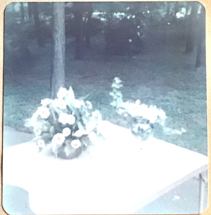
↑ KAT GRAY