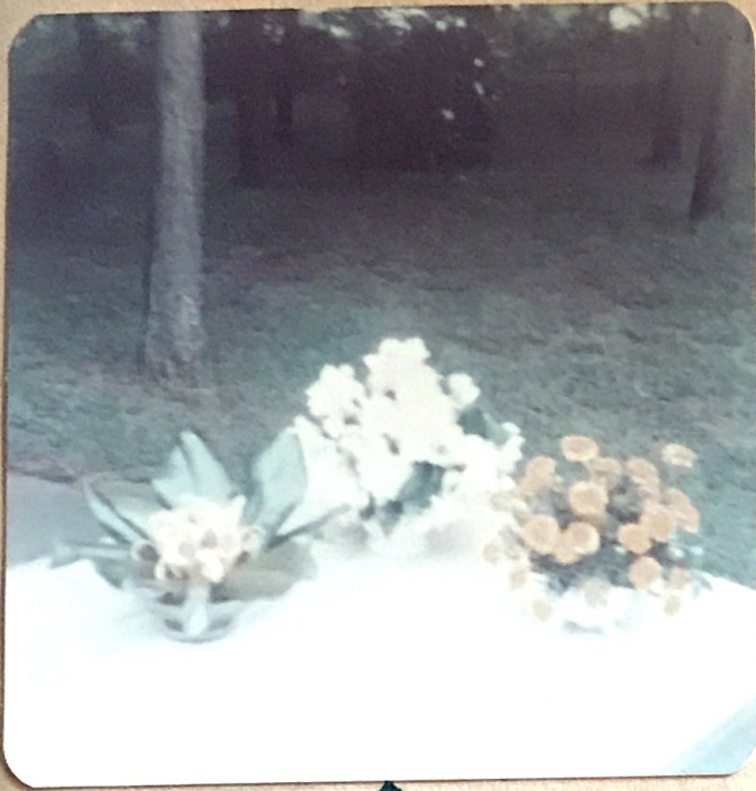
↑ MILDRED FORD