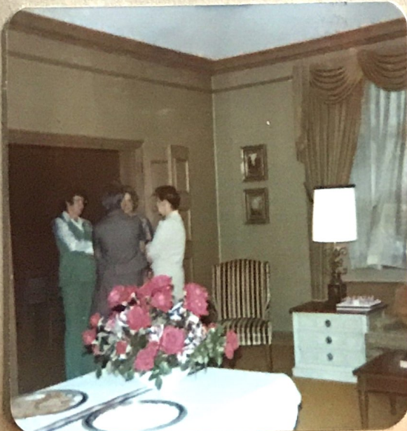
FIRST PRESBYTERIAN CHURCH