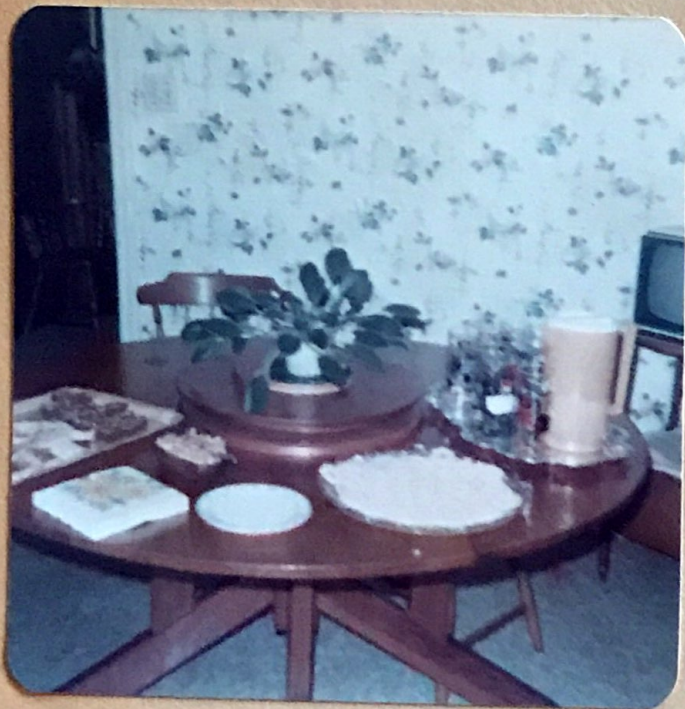
ETHEL'S TABLE FUN TIME!

The meeting was then adjourned until next September since the club does not meet during the months of July and August.