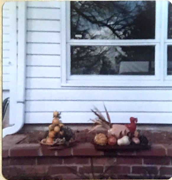
AT SWE HOME'S