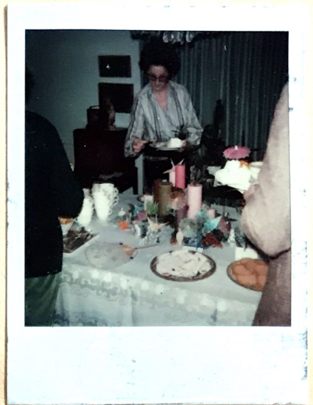
JAPANESE PROGRAM AT CLARA'S