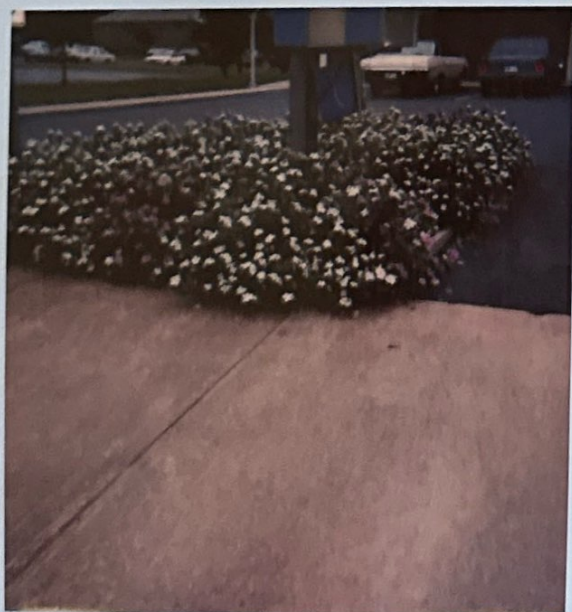
at The Post Office