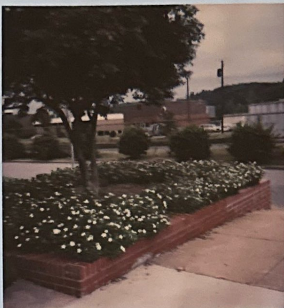
Old P.O.H. Depot