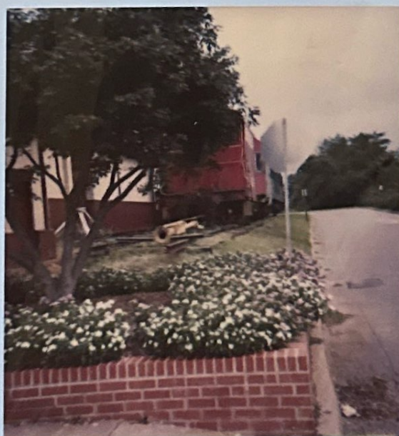
Old P.O.H. Depot