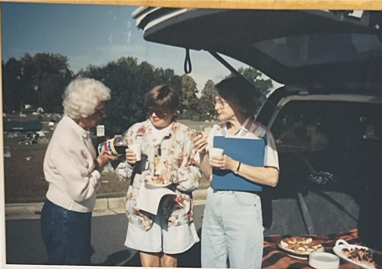
a labor of love