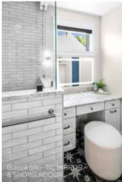
Glasswork + TC MIRROR & SHOWERDOOR

Thoughtful design takes time and for this empty-nest couple, Endura Performance Homes designed and built a beautiful new home with the heart of an old farmhouse to entertain family and friends for generations. □