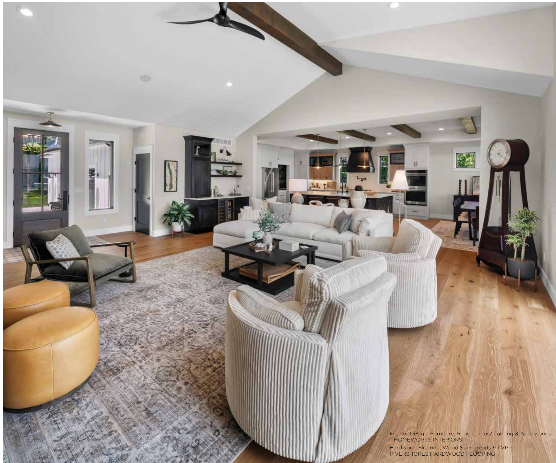
Interior Design, Furniture, Rugs, Lamps/Lighting & Accessories - HOMEWORKS INTERIORS Hardwood Flooring, Wood Stair Treads & LVP - RIVERSHORES HARDWOOD FLOORING