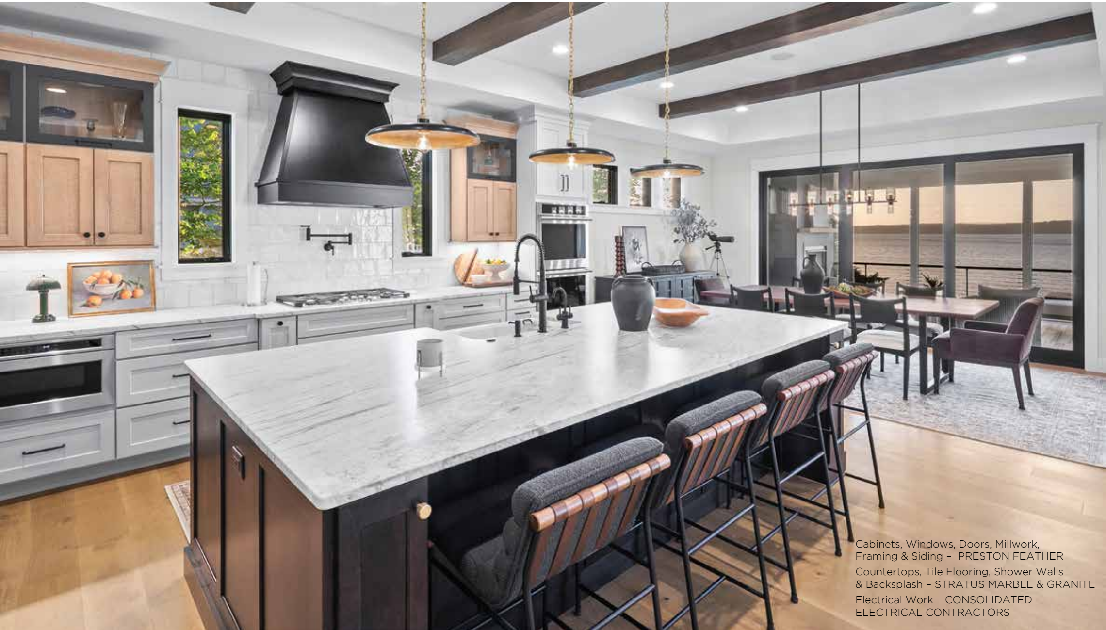
Cabinets, Windows, Doors, Millwork, Framing & Siding - PRESTON FEATHER Countertops, Tile Flooring, Shower Walls & Backsplash - STRATUS MARBLE & GRANITE Electrical Work - CONSOLIDATED ELECTRICAL CONTRACTORS

"It's my favorite spot," the wife says. "You have the best look at the lake, you get the morning sun without having to deal with the bugs."