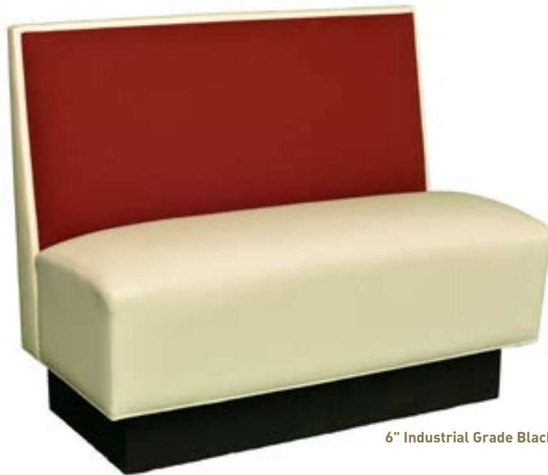
6" Industrial Grade Black Vinyl Bottom Base