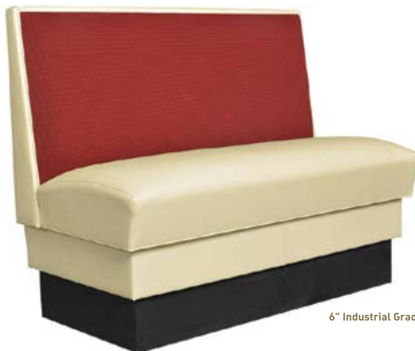
6" Industrial Grade Black Vinyl Bottom Base