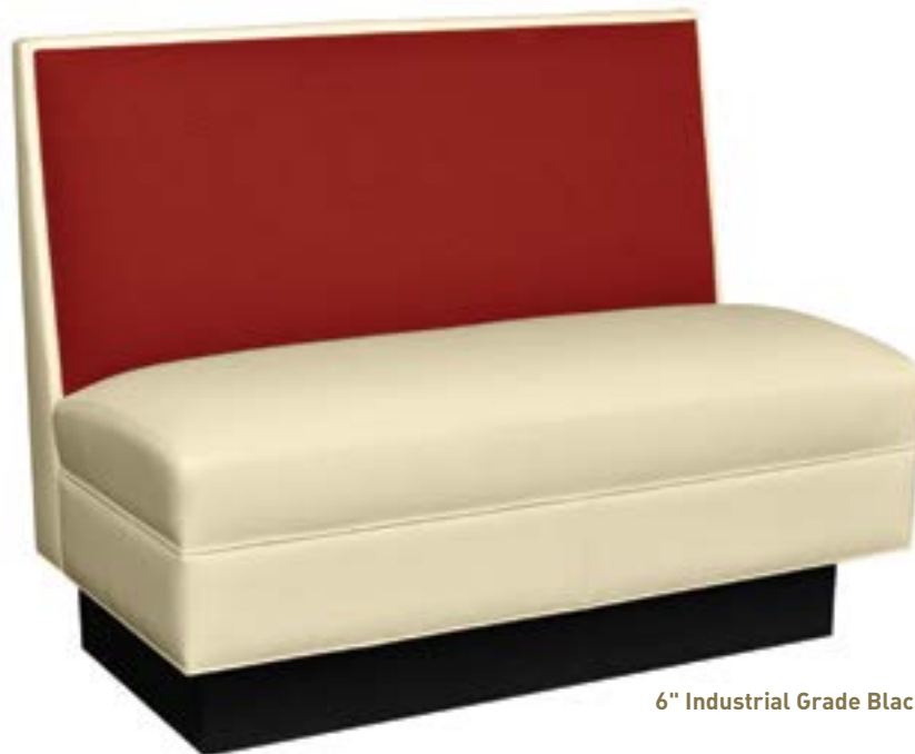
6" Industrial Grade Black Vinyl Bottom Base