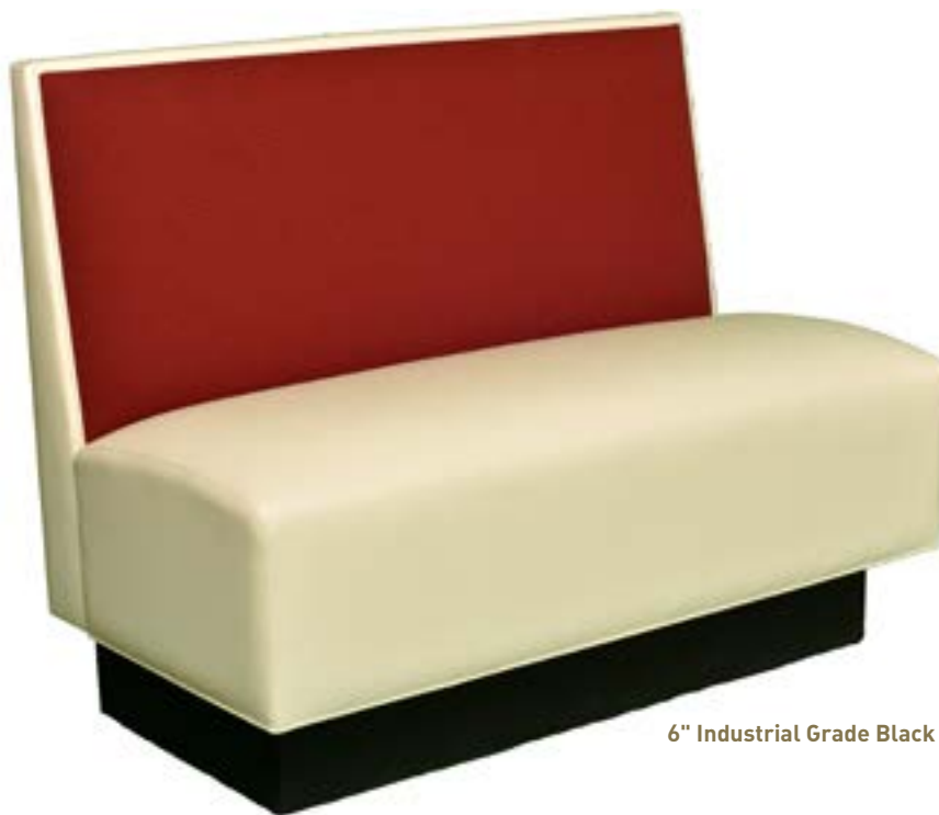
6" Industrial Grade Black Vinyl Bottom Base