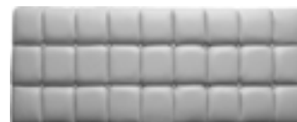
Sewn Biscuit SB-101-B/OST/OSL