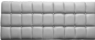
Sewn Biscuit SB-101-B/OST/OSL