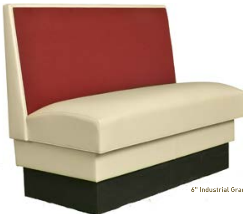
6" Industrial Grade Black Vinyl Bottom Base