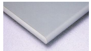
Industrial Top with a Full Bullnose