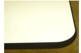
Anti-Static Laminate Top with T-Mold