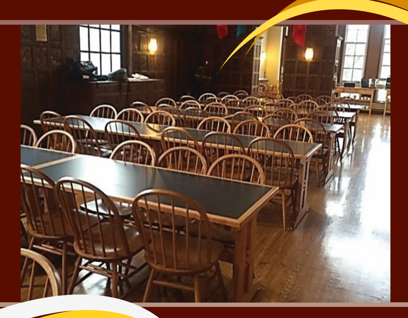
Table Tops made from

Solid Wood Veneer Laminate Padded Thermofoil Solid Surface