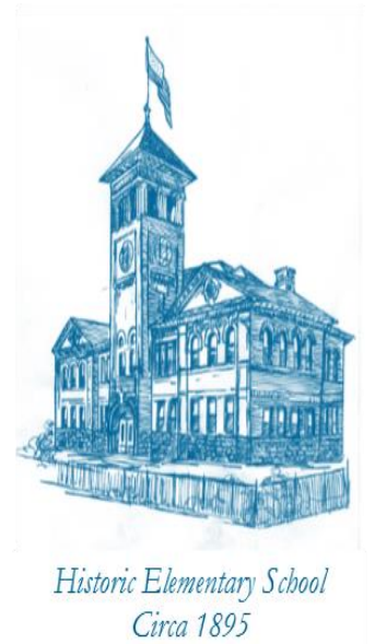
Historic Elementary School Circa 1895