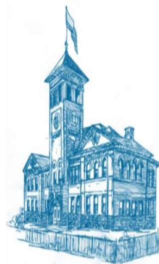
Historic Elementary School Circa 1895