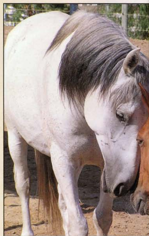
Storm and Rusty showed almost identical HRV patterns, raising the question of whether horses, when interacting with humans, could indicate their sentient nature.

We found that when humans projected a positive emotional state to the horse, a frequency spike appeared in the person's HRV of about 0.1 cycles/second. This means that when people experience positive emotions their heart rate cycles up and down regularly every 10 seconds. This gives us a way of measuring whether a person is effectively projecting positive emotions or not. Interestingly, the HRV frequencies specific to that horse showed up in all but one of the human subjects' HRV. It appeared that each person synchronized his or her particular HRV frequency cycle to