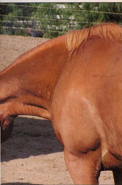
hms during pilot study 3, which explored the each other, exhibited signs of emotion that

horses and humans that can be measured using heart rate variability to potentially determine levels of stress or well-being in the human and the horse when interacting.