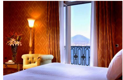
Old World Luxury: rich colors + sea view

Late morning lezione d'italiano: My travel motto is "Go Local, Know Local." I will encourage any and all attempts to speak Italian and will facilitate your communication with the wonderful guests who will be a vibrant part of your experience. I will offer custom-made, fun cultural activities designed to stimulate and awaken your senses and cultural awareness.