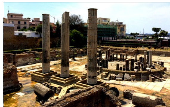
Macellum (1st c. AD) aka the Temple of Serapis

We will visit the best preserved colosseum in Italy (same architects who built the more famous Colosseo in Rome), site of fantastic games and spectacles ( San Gennaro, Napoli's patron saint was condemned to a death by wild beasts- but survived!); the Macellum (aka Temple of Serapis, 1st c AD) a Roman marketplace and perhaps the most important example of bradyseism in the world demonstrating the dynamic geological forces at work below the earth's surface (or as the Greeks believed, all that underground commotion was caused by captive Titan gods trying to escape).