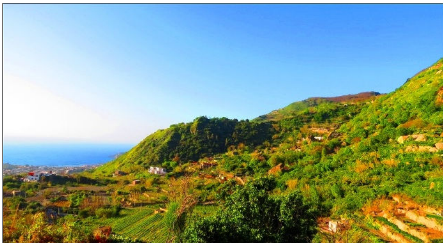
Ischia is nicknamed the "isola verde", a perfect mix of forest, farm, tuff and sea life.