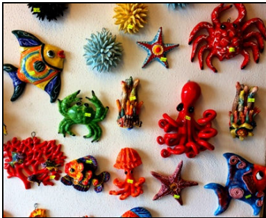
Visit a family-owned ceramics shop

I will be happy to help you with your free-day activities and make suggestions, should you wish.