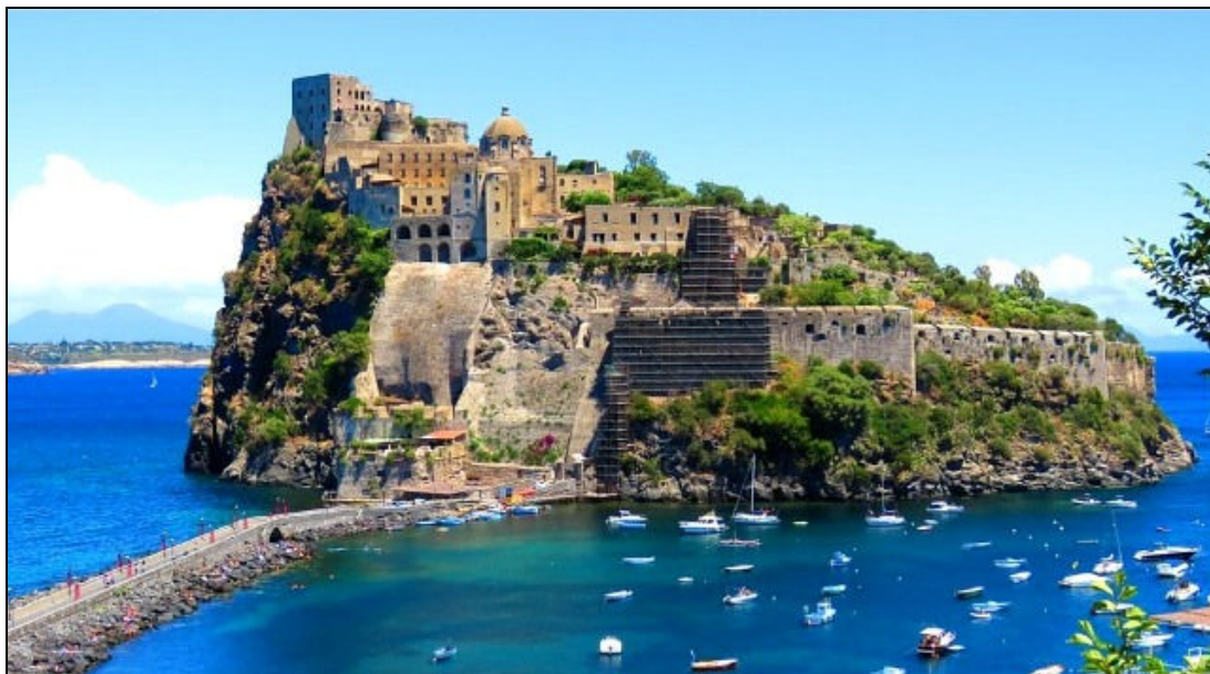
Castello Aragonese: Greek Hiero I (478 BC) to Alfonso of Aragon, to Renaissance glamour girl Vittoria Colonna, gal-pal of Michelangelo

After our Castello tour, we will enjoy a lunch and your afternoon will be free to wade in the waters, explore Ischia's main port area, site of lovely cafés, restaurants, shops and boutiques.