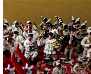
Pulcinella, important symbol of Napoli originating in the Commedia dell'Arte