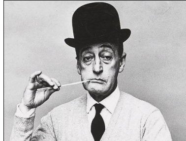
Totò, comic genius & Neapolitan treasure