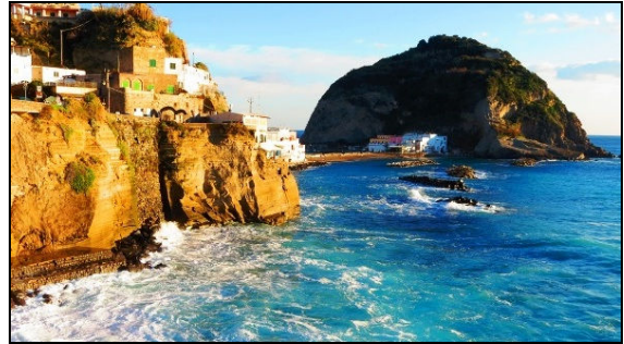
View from beach below of our accommodations.

You will probably sleep so well from your day at the spa and since it's your free day you very well may head right back there for another glorious day—or try another amazing spa. Or maybe you will opt to go to Capri, the sister island.