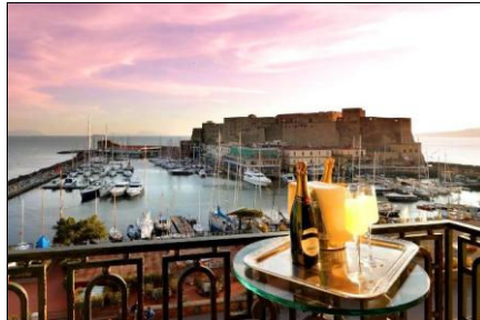
Your hotel balcony: Borgo Marinari + Castel dell'Ovo