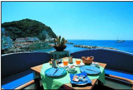
Breakfast view from our hotel.