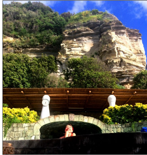
Lisa relaxes in a thermal pool, enjoying the magnificent view.