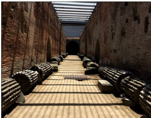
Colosseum (circa 66 AD): best preserved in Italy

CAMPI FLEGREI + CUMAE: Our driver will whisk us off to the Bay of Pozzuoli , the home of the first Greek settlement on the continent! The Flaming Fields are so geologically unique as to have spawned the timeless tales of Homer and Virgil , and play a principal role in Greco-Roman mythology . Centuries after the Greeks arrived, ancient Rome's elite, like Cicero and Nero , would build their villas here, lured by the natural beauty, abundance of excellent fish, seafood and wines, volcanic waters, muds- all great after a tough week at the Forum. Even St. Paul stopped in and stayed for seven days on his way to Rome to stand trial! And while I'm name dropping, Sofia Loren grew up here (where she was discovered by De Sica ).