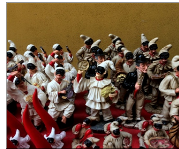
Pulcinella, important symbol of Napoli that originates back to the Commedia dell'Arte

Breakfast on the Grand Terrace with that gorgeous view .