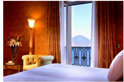
Old World Luxury: rich colors + sea view

CAMPI FLEGREI + CUMAE: Our driver will whisk us off to the Bay of Pozzuoli , the home of the first Greek settlement on the continent! The Flaming Fields are so geologically unique as to have spawned the timeless tales of Homer and Virgil , and play a principal role in Greco-Roman mythology . Centuries after the Greeks arrived, ancient Rome's elite, like Cicero and Nero , would build their villas here, lured by the natural beauty, abundance of excellent fish, seafood and wines, volcanic waters, muds- all great after a tough week at the Forum. Even St. Paul stopped in and stayed for seven days on his way to Rome to stand trial! And while I'm name dropping, Sofia Loren grew up here (where she was discovered by De Sica ).