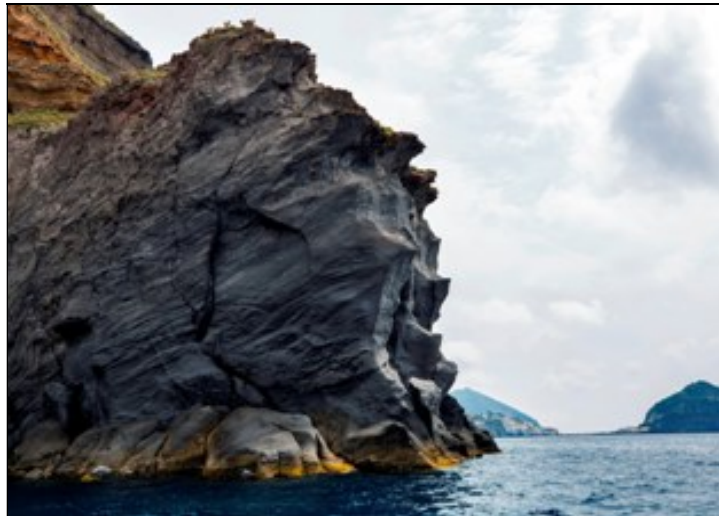
Ischia by boat: the best way to experience the unique, rugged landscapes and blue waters.

Private Boat Excursion along the coastline from Sant'Angelo. There is no better way to experience the colors and cliffs of the stunning island. It's a priceless experience arriving by boat to natural springs that bubble up into the sea (nature's hot tubs!), swimming in bio-diverse waters. Light lunch onboard.