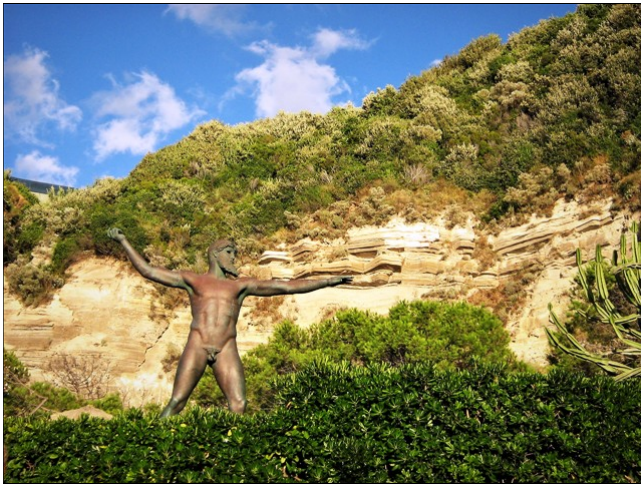
Poseidon in all his glory, bathed in beautiful colors of tuff and foliage.

Lunch is on your own. There are a variety of dining choices in the complex or immediately outside its gates.