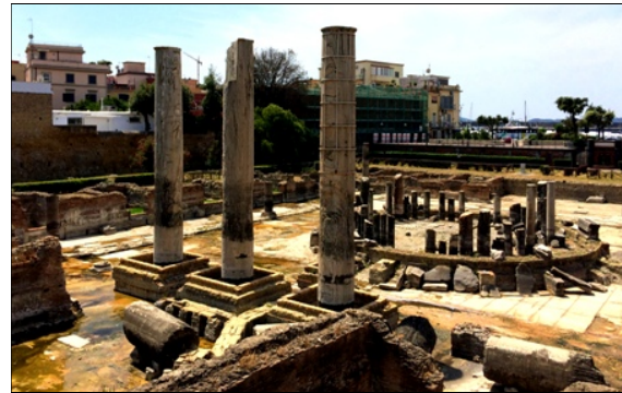
Macellum (1st c. AD) aka the Temple of Serapis

We will visit the best preserved colosseum in Italy (same architects who built the more famous Colosseo in Rome), site of fantastic games and spectacles ( San Gennaro , Napoli's patron saint was condemned to a death by wild beasts- but survived!); the Macellum (aka Temple of Serapis, 1st c AD) a Roman marketplace and perhaps the most important example of bradyseism in the world demonstrating the dynamic geological forces at work below the earth's surface (or as the Greeks believed, all that underground commotion was caused by captive Titan gods trying to escape).