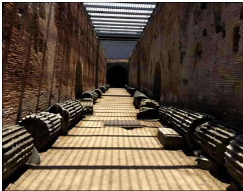
Colosseum (circa 66 AD): best preserved in Italy

CAMPI FLEGREI + CUMAE: Our driver will whisk us off to the Bay of Pozzuoli , the home of the first Greek settlement on the continent! The Flaming Fields are so geologically unique as to have spawned the timeless tales of Homer and Virgil , and play a principal role in Greco-Roman mythology . Centuries after the Greeks arrived, ancient Rome's elite, like Cicero and Nero , would build their villas here, lured by the natural beauty, abundance of excellent fish, seafood and wines, volcanic waters, muds- all great after a tough week at the Forum. Even St. Paul stopped in and stayed for seven days on his way to Rome to stand trial! And while I'm name dropping, Sofia Loren grew up here (where she was discovered by De Sica ).