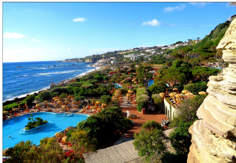
The ultimate in relax: a series of thermal pools with private beach in a beautiful natural setting.