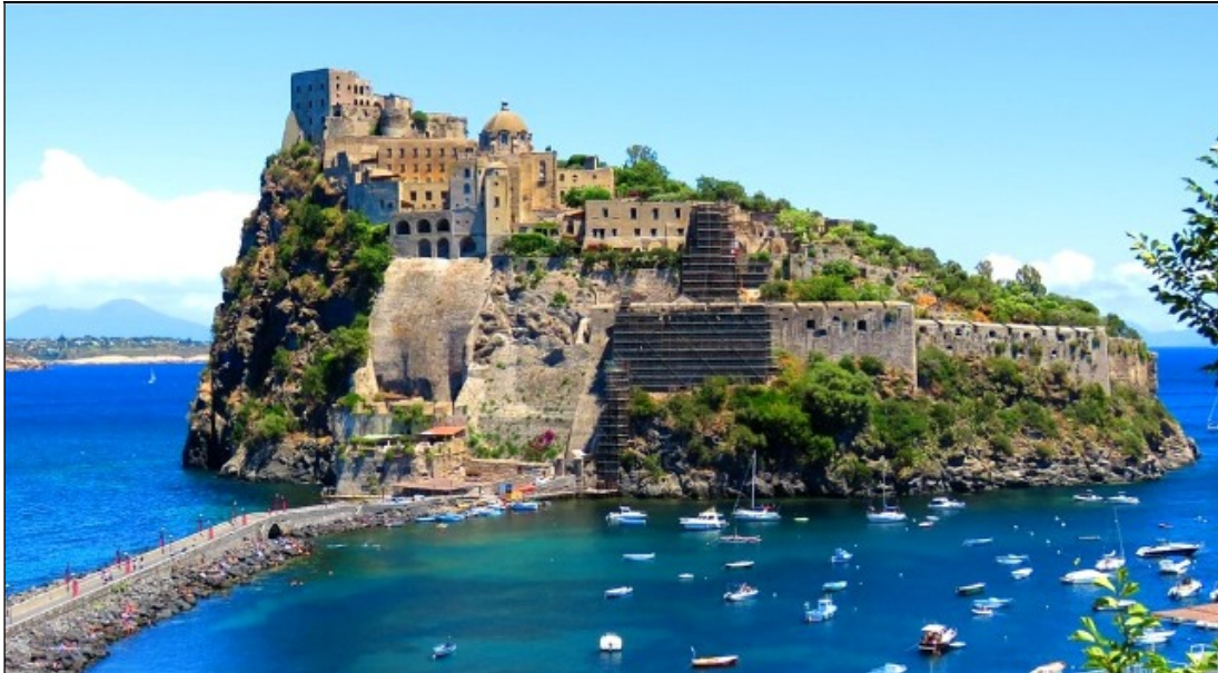
Built atop a giant magma bubble the Castello Aragonese served as home to to Greek Hiero I (478 BC,) Alfonso of Aragon and Renaissance glamour girl Vittoria Colonna, gal-pal of Michelangelo.

Farewell Dinner: Mamma mia! How the time flies! We gather to toast new friendships with an exuberant Italian-style send-off!