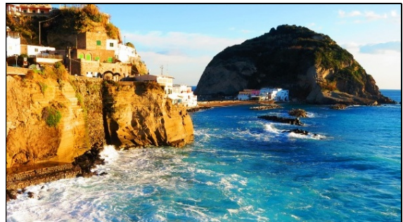
View from beach below of our accommodations.

You will probably wake up so refreshed from our day basking in natural spa waters that you may head right back there for another glorious day. Hop a boat to Capri? But we invite you to consider a truly inspirational adventure in Nature.