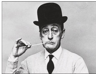
Totò, comic genius & Neapolitan treasure