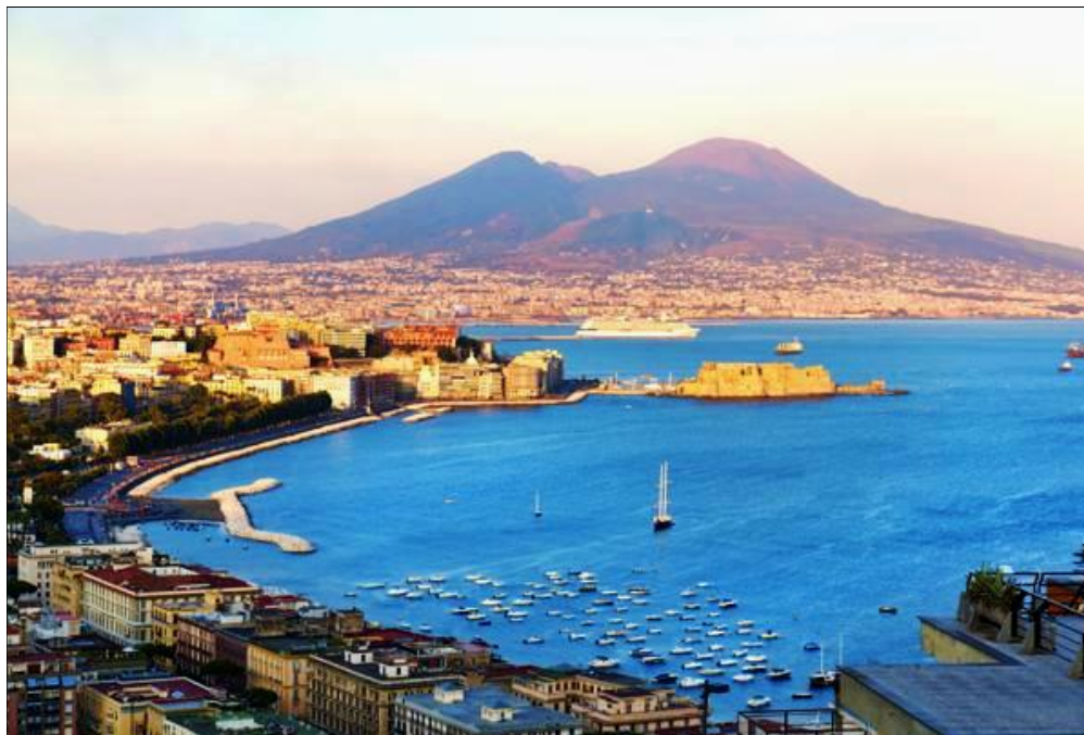
View to Vesuvius. See the golden Castel dell'Ovo? The balcony of your luxury hotel room overlooks it!

DAY 1: SUNDAY, SEPTEMBER 13, 2020. Old World Luxury, Fine Dining, Castel dell'Ovo , and Vesuvius (A, D)