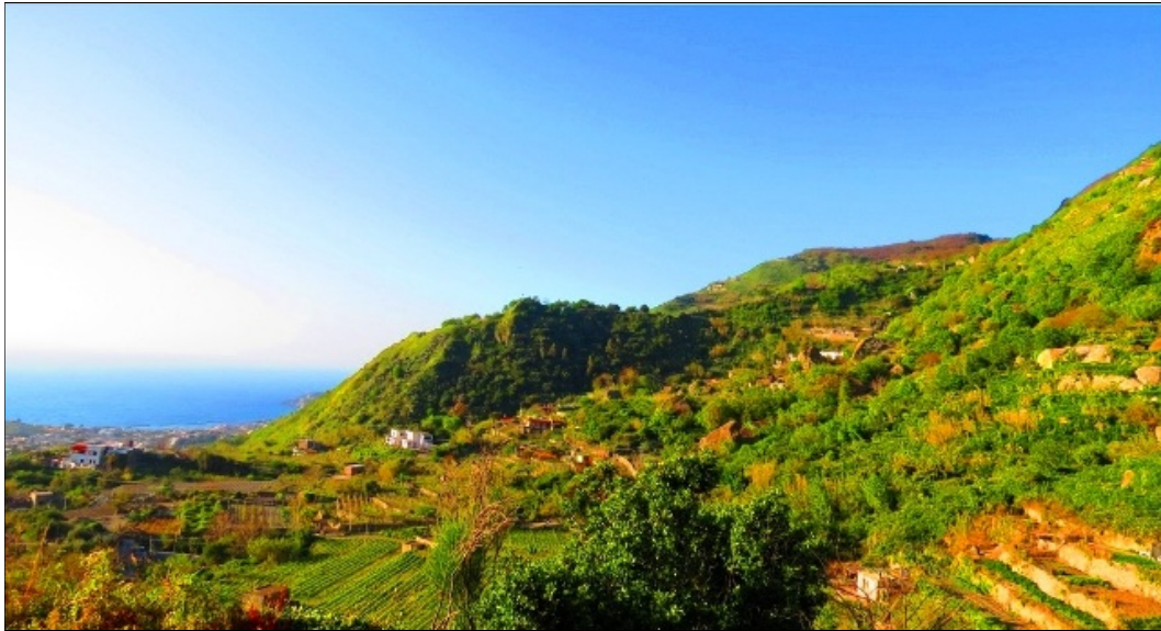
Ischia is nicknamed the "isola verde", a perfect mix of forest, farm, tuff and sea life.