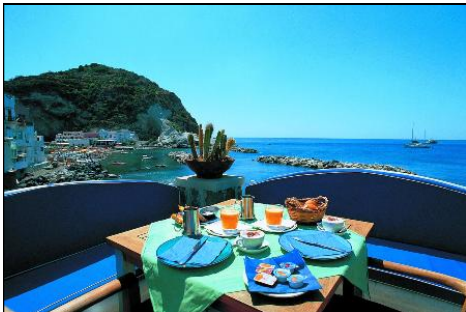
Breakfast view from our hotel.