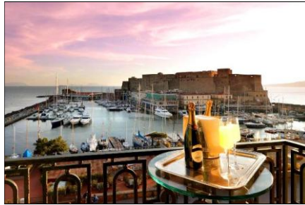
Your hotel balcony: Borgo Marinari + Castel dell'Ovo