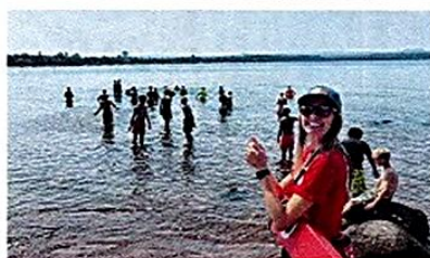
Lifeguarding for adventures!

We have a full Fall schedule! We are looking forward to Mother Daughter Retreat, 5 Fall Fest Youth Group Weekends, Crafters Retreats, and more! And yes, we are already thinking about summer 2026!