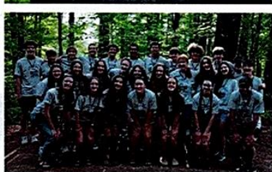
Leadership Development Camp