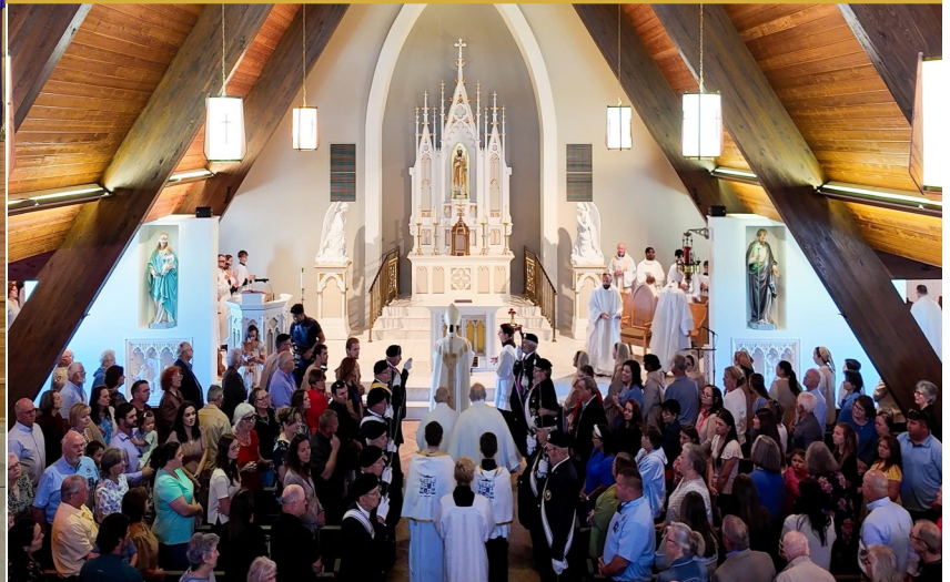
Below: Honor Guards for the Lift 3:16 Youth Conference at St. Bernadette and the re-opening at St. Eloi Church.