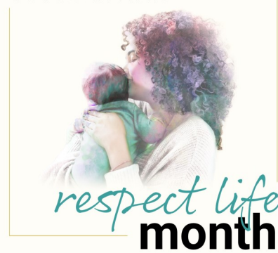
Photo used for RespectLife purposes only.