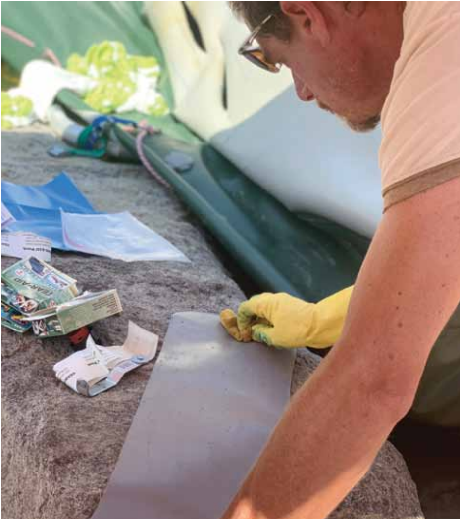
Preparing the patch

It took a moment for my tactile sense to register with my brain, that what I was feeling was not the exterior of the tube, but instead the interior. Instead of running my hands along the outside of the tube, I had inserted my hand into what turned out to be a nearly contiguous 17-inch tear running parallel to the tube, a few inches below waterline. I stood up, a little shaky. “Guys,” I said. “It’s a big rip.”