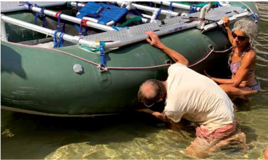
Feeling for bubbles

a sinking ship. The lightning storm and accompanying downpour held off just long enough for us to reach a larger spit of sand at the far end of the canyon, and we hopped on to dry land to wait out the storm on shore.