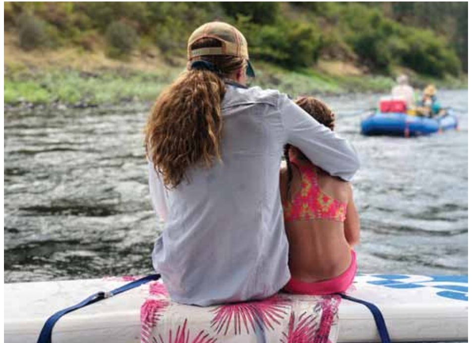
River-running cousins perched on a SUP

It takes less than a day to surrender to a river. Once rubber (or vinyl, or urethane) meets water, our internal rhythms succumb to the tempo of the river. The stresses of juggling schedules to sync up, the planning and packing, the shared spreadsheets for gear and food, the last-minute gear orders, and the fierce protection of the ice supply on the long drive—all evaporate from our