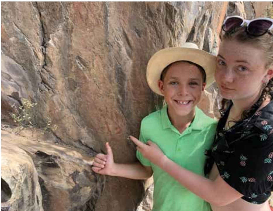
Signs of those who passed this way before

More than just a special place, though, the Lower Salmon represents for my siblings and our families a bit of an idyll—a distinct swath of time of devoted completely to the pursuit of fun. Framed by rust-colored basalt columns and glittering sandbars, the Lower Salmon is a state of mind. Our kids enjoy being with us (or they put on