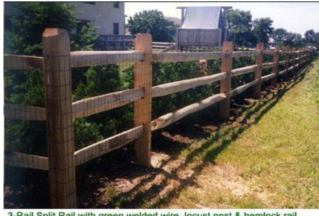
3-Rail Split Rail with green welded wire, locust post & hemlock rail