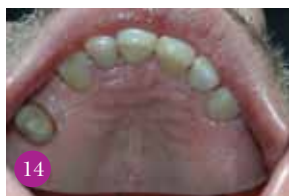
Figs 11, 12, 13 and 14 Bleaching and bonding of the dark worn teeth with composite does not damage the pulps or the load bearing structure of the teeth.