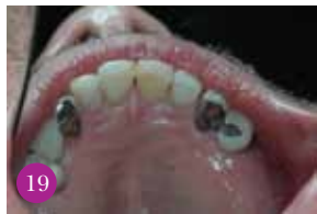
Figs 18 and 19 Bonding of the worn teeth at an increased anterior vertical dimension meant there was space created for the metal pads without removing any of the residual worn (but valuable) enamel.