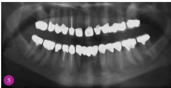
Fig 3 Six dead teeth as a result of the treatment for hyperenamelosis by application of porcelain bonded to metal crowns and bridges.