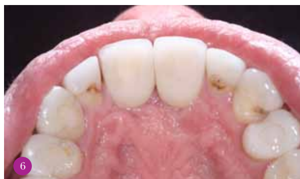
Fig 6 The upper right canine and both upper premolars had to be root filled following preparations for this porcelain pornography.

'double mugging': these unfortunate patients are being robbed twice – first of their money and again of their enamel and dentine