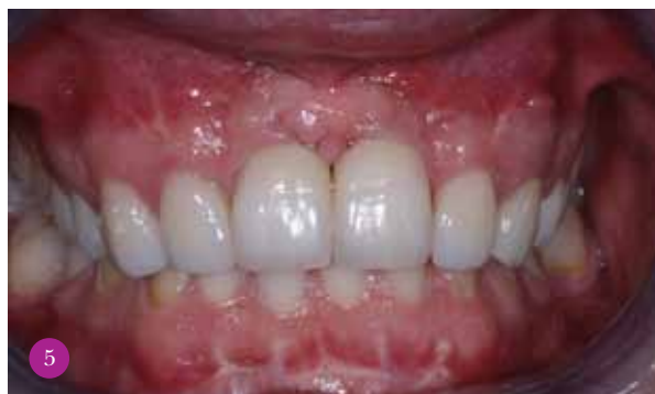
Fig 5 This patient apparently lost two front teeth (now replaced with implants) as well as the nerves of three teeth.

When an air rotor assault is launched on virtually intact teeth, the innocent dental pulps are given no chance to retreat. Extensive preparation of intact teeth for ceramic-based crowns is very different to preparing teeth that have been previously attacked by dental caries. Caries is a slow process and often gives the pulp a chance to retreat and lay down secondary or reparative dentine. No such warning is available for the intact teeth undergoing preparation: the high pitched whine of an air rotor signals the imminent stripping of their invaluable enamel