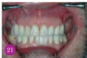
Figs 20 and 21 Direct, free-hand composite bonded to the lingual enamel as well as the incisal enamel, provided it is placed in thick section, does well. 2

strength of the teeth, then, in my view, addition beats subtraction when dealing with wear and many other cosmetic problems. In other words, it is more sensible to add to the worn or irregular teeth than to reduce the damaged teeth even further, both for reasons of strength and also for the preservation of residual pulpal health.