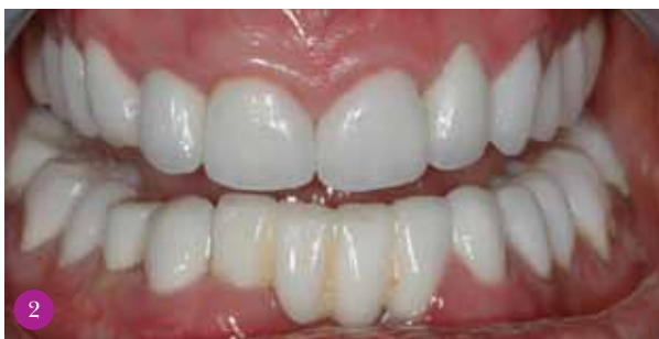
Fig 2 Patient as presented (apparently cured of PDD)