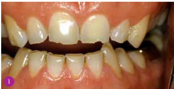
Fig 1 Teeth that are 'mainly intact', ie with mild wear that could be addressed through less aggressive treatment such as bleaching and bonding to achieve the 'nice smile' the patient desires.