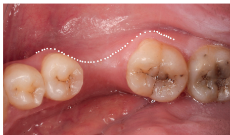
FIGURE 1: Preoperative occlusal view showing insufficient attached zone around the edentulous space.

final position. For the stent group, the apically repositioned flap was secured around the healing abutment with the help of the readymade plastic stent.