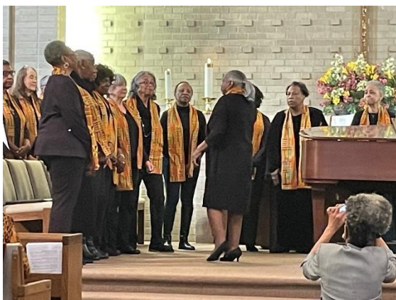
Singing for Dr. King