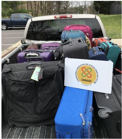
Luggage collection for Shepherd's Table