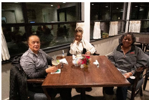
Post-meeting dinner with friends