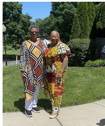
Scenes from the June Gathering on the Lanai