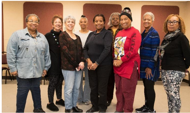
New members' orientation