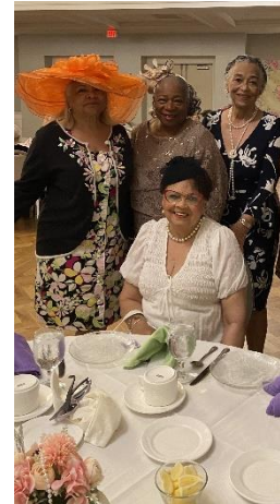
Ladies at tea