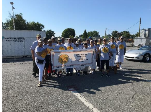
July 4, 2023