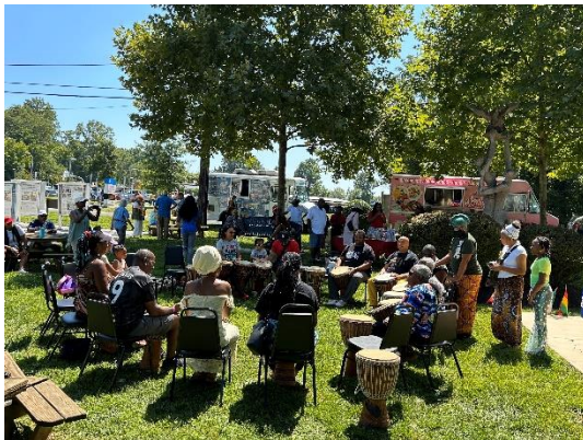
Drummers at the Slave Museum