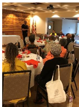
Health & Wellness Event, 6/25 (Sponsored by Mu Nu Chapter/Omega Psi Phi)