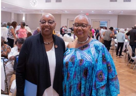
Passing the torch