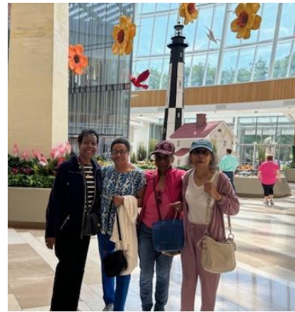
At National Harbor