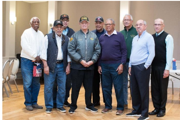
Thank you for your service