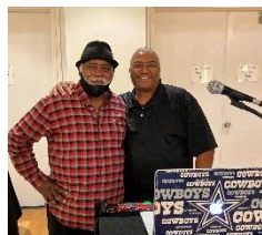
The music men