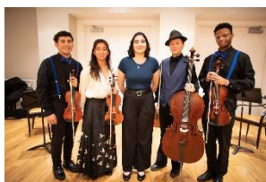
Play on, children!