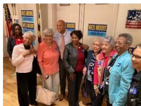
He made it: Governor Moore