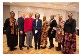
King Day program participants