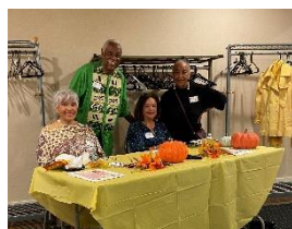
Fall program greetings