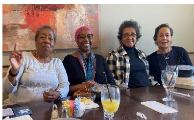
Sister Circle Lunch