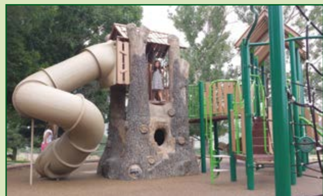
New Beverly Heights Playground Opened in 2014.

13 Neighborhood Parks, 4 of which are pocket parks: Beverly Heights Park, Discovery Park, Golden Heights Park, Heritage Dells, New Loveland Mine Park, Norman D. Park, Parfet Park, Southridge Park, White Ash Mine Park, Cressman Park, Neighborhood Park, Rimrock Park, Vanover Park. Neighborhood parks are parks that serve a residential neighborhood.