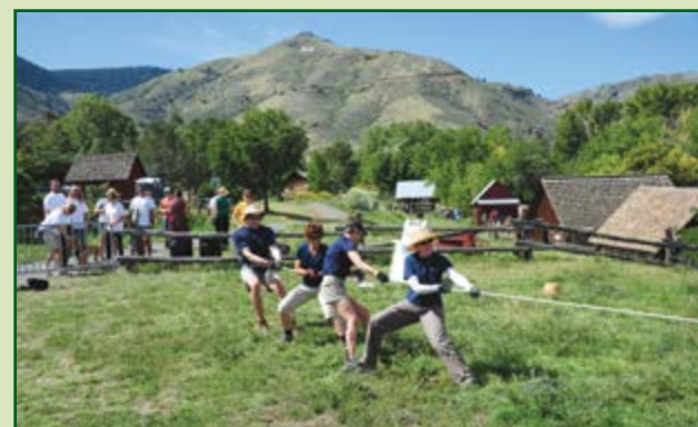
Golden Frontier Olympics at Clear Creek History Park.

*All other City of Golden park pavilions are first come, first serve.