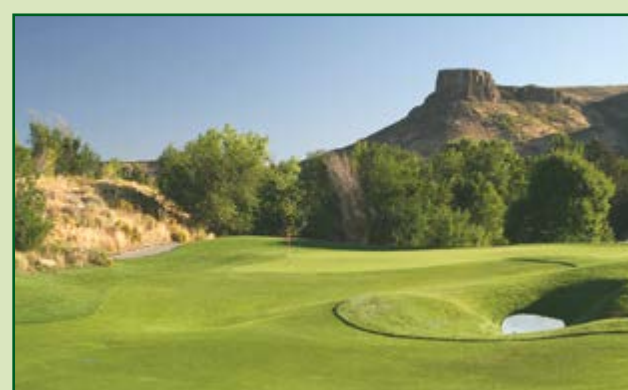
Fossil Trace Golf Club.