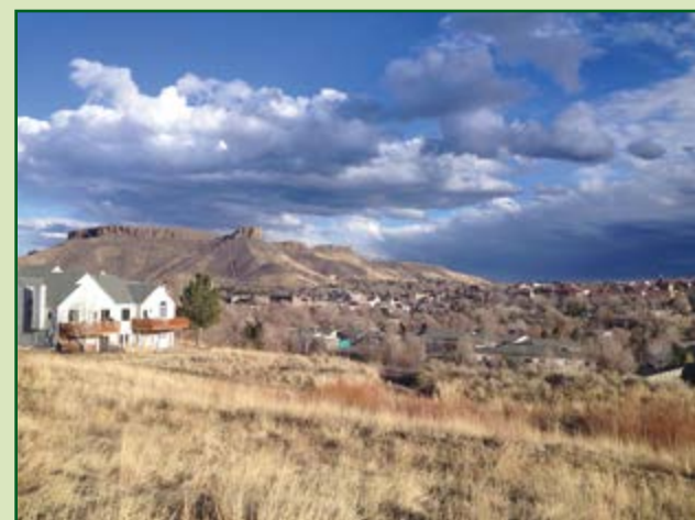
View from New Loveland Mine Park.

The Golden Parks and Recreation Department is committed to the development of urban parks, vibrant recreation programming and preservation of the natural and historic resources in the City of Golden.