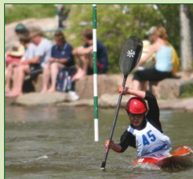
Kayak Games at Clear Creek Whitewater Park.