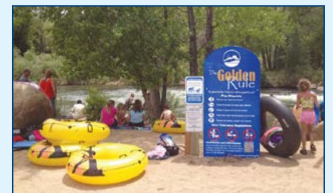
Golden Rule signage and zero tolerance regulations were introduced in 2013.

Electronic version of this brochure, Google Map directions to trailheads and more information is available at: www.cityofgolden.net/links/parksandrecreation www.VisitGolden.com