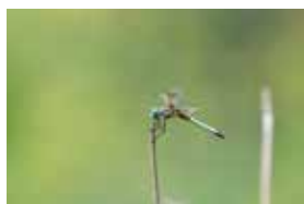
Karcsi George Piedl Youth Great Blue Skimmer photograph 15”h x 18”w price on request

“These images were created in the ice in a forest stream as it froze in the winter by a Dryad Fairy that lives in forest trees. The Dryad is a very artistic fairy and is one many types that live in the forest.”