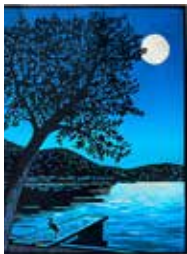
JACK R. MOORE East Meets West at Cedar Lake linoleum block print 18”h x 14”w $200

“I live and work in an old gristmill on the banks of the Musconetcong river. From my windows I can watch birds of all sizes. One day, when the river was low, three egrets showed up to wade and fish. They stayed all afternoon. At 5 pm exactly, they took to the air and flew upstream. I love the shapes their pure white bodies make against the dark stream. I used a wet in wet technique for the water, letting dense color flow around the birds. My work challenges personal observations of everyday life through a multidisciplinary approach to painting, printmaking, and assembly. In our fast-paced lives of perpetual doing and not enough BEING, I value slowing down to observe and record the beauty in the ordinary.