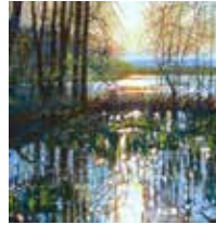
Swamp June 17 2:01 PM oil on linen 30”h x 30”w $3,500 $800

ARTIST INFO: https://tinyurl.com/Todd-Doney