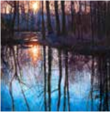
TODD DONEY Reflected Trees Feb 15 5:08 PM oil on linen 48”h x 48”w $9,000