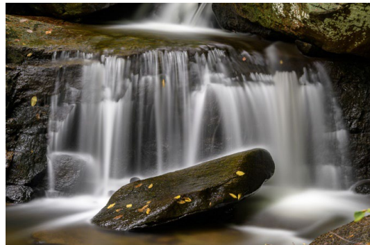
© Chad Mooney (Bloomfield NJ) Hudson River Sunset photograph