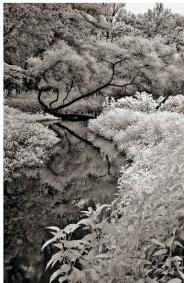
© George Aronson (Morristown, NJ) Passaic River Flowing Through the Great Swamp photograph