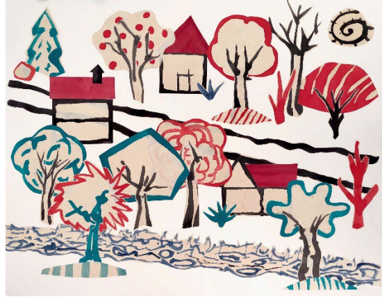
© Michael McFadden (Hampton, NJ) Watercolor Collage