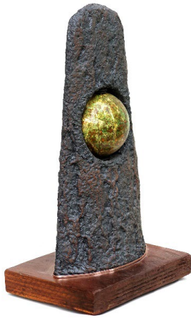
© Barry Zawacki (Boonton, NJ) Mother Earth ceramic sculpture