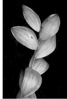
Vine photograph