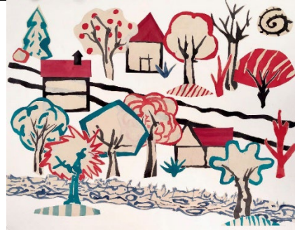
© Michael McFadden (Hampton, NJ) Watercolor Collage