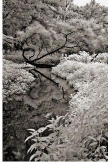
Passaic River Flowing Through the Great Swamp photograph