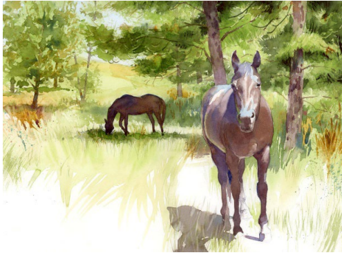
© Doris Ettlinger (Hampton, NJ) Two Horses in Light Shade watercolor