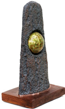
© Barry Zawacki (Boonton, NJ) Mother Earth ceramic sculpture