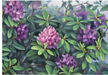
© Janet Cunniff-Chieffo (Denville, NJ) Rhododendrons En Plein Air oil