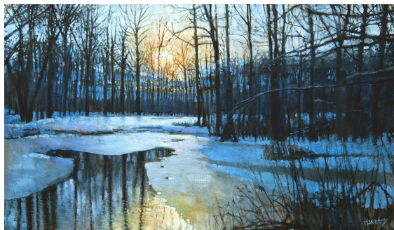
© Todd Doney (Gillette, NJ) Swamp Jan 25 5:14 pm oil

To view all the art in this exhibit, please visit https://www.highlandsart.org Contact Donna Compton for further information 973-910-2400 or email highlandsart@njhighlandscoalition.org