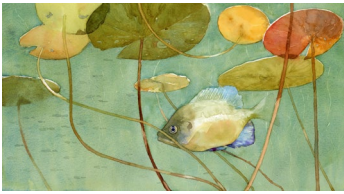
Doris Ettlinger, Blue Gil , watercolor