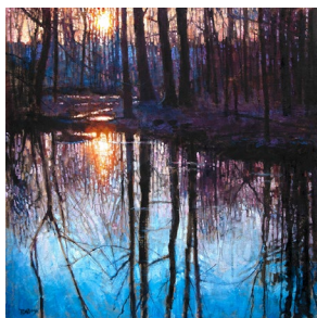
Todd Doney, Swamp, June 17, 2:01 PM oil painting https://tinyurl.com/Todd-Doney