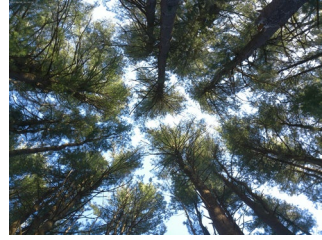
Benjamin Janis ( Youth Category ), Jonathan's Woods photograph