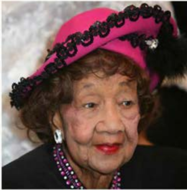
DR. DOROTHY HEIGHT