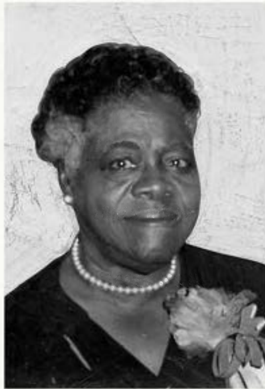
DR. MARY MCLEOD BETHUNE (1875-1955) FOUNDER NATIONAL COUNCIL OF NEGRO WOMEN , INCORPORATED

"I LEAVE YOU LOVE. LOVE BUILDS. IT IS POSITIVE AND HELPFUL. IT IS MORE BENEFICIAL THAN HATE. INJURIES QUICKLY FORGOTTEN QUICKLY PASS AWAY. PERSONALLY AND RACIALLY, OUR ENEMIES MUST BE FORGIVEN. OUR AIM MUST BE TO CREATE A WORLD OF FELLOWSHIP AND JUSTICE WHERE NO MAN'S SKIN, COLOR OR RELIGION, IS HELD AGAINST HIM. "LOVE THY NEIGHBOR" IS A PRECEPT WHICH COULD TRANSFORM THE WORLD IF IT WERE UNIVERSALLY PRACTICED. IT CONNOTES BROTHERHOOD AND, TO ME, BROTHERHOOD OF MAN IS THE NOBLEST CONCEPT IN ALL HUMAN RELATIONS. LOVING YOUR NEIGHBOR MEANS BEING INTERRACIAL, INTERRELIGIOUS AND INTERNATIONAL."