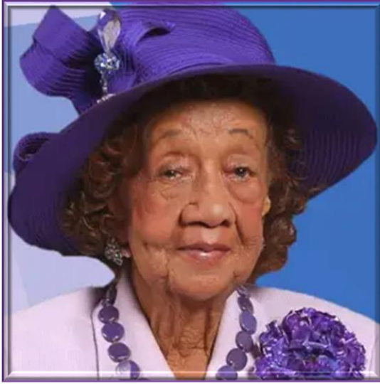
Dr. Dorothy Height