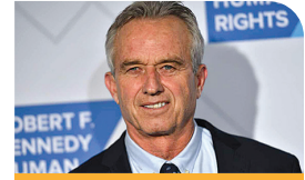
Robert F. Kennedy Jr. Chairman of Children's Health Defense

In a letter to the UK's Joint Committee on Vaccines and Immunisation, more than 30 politicians, doctors and medical experts said long-term effects from Covid vaccines could compromise the life expectancy of the country's children. [Jan 2022] https://childrenshealthdefense.org/defender/myocarditis-uk-regulators-reassess-covid-vaccines-children/?itm_term=home