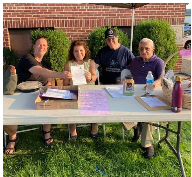
From Top Left to Bottom Right: RAP/People's Pantry, Parkside Community Church, Jewish Family & Children's Services, St. Anne's Food Pantry