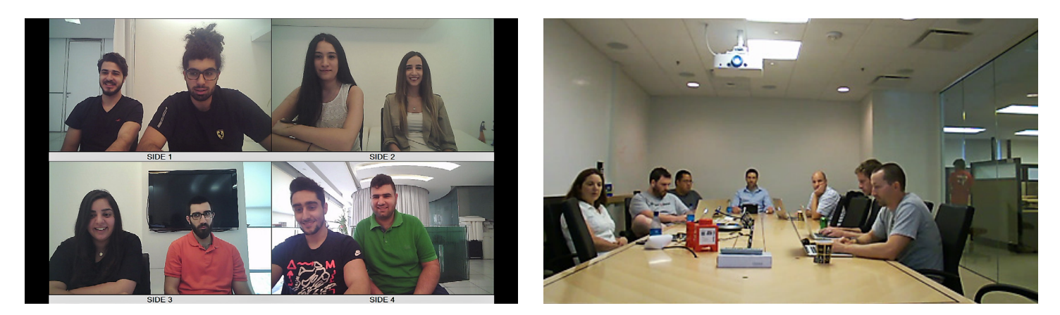
Participants around a Silex PTE Quattro system

As well as avoiding the classic "bowling alley" view seen in many traditional video conferencing set-ups, the PTE introduces a degree of "participant equality". All participants appear the same size on the screen (unless active speaker mode is engaged) and this, together with the facial recognition feature mentioned below, can really help with the flow of the meeting. No-one is hidden behind others, no-one is a small face at the end of the table. As King Arthur observed, a round table ensures equality amongst participants and the PTE replicates this process!