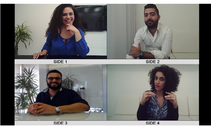
Quad view - PTE Quattro