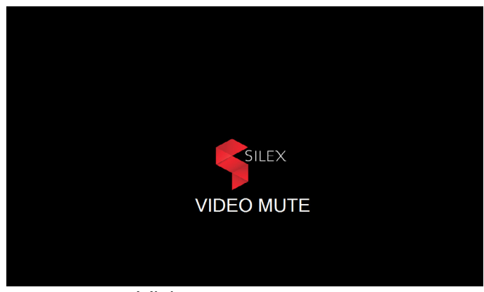
Video mute screen

Selectable video layouts during video calls: Includes a choice of pre-set layouts to select from in a click for an efficient and productive collaboration experience. These include: single side view, surround panoramic view, standard panoramic view, video mute, combined desktop with horizontal / vertical panoramic views of cameras and desktop only view