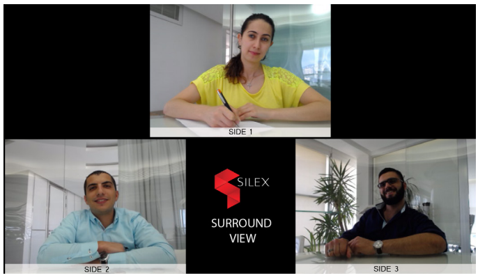
Surround panoramic view - PTE Trio