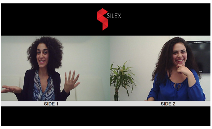
Dual view - PTE Duo +