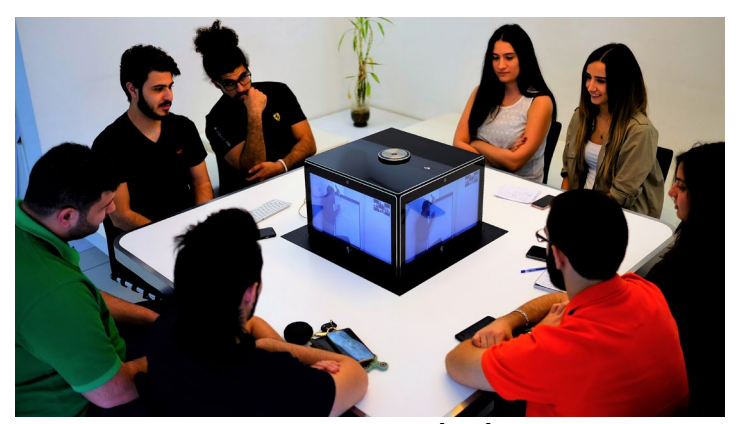
Silex PTE Center of table (CoT) concept