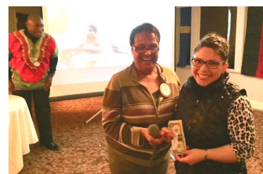
More photos from International Night 2019