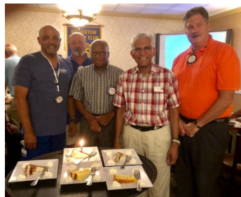
Below: The club recognizes members' birthdays and the anniversaries of when they joined the Rotary Club.