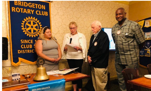
Right photo: New Member Welcomed!