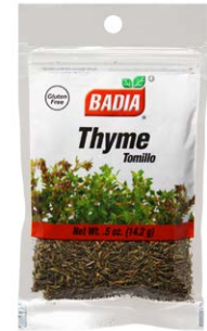
THYME LEAVES - 00209 12/0.5 OZ