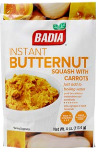
INSTANT BUTTERNUT SQUASH WITH CARROTS - 01262 6/4 OZ