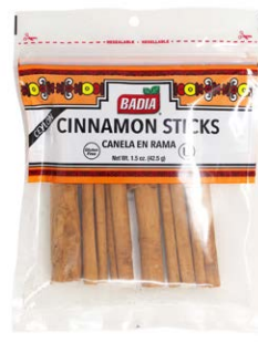
CINNAMON STICKS - 00690 12/1.5 OZ