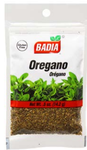
OREGANO WHOLE - 00021 12/0.5 OZ