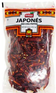
JAPONÉS (RED CHILI PEPPER) - 00681 12/6 OZ