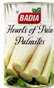
HEARTS OF PALM - 00449 12/14 OZ