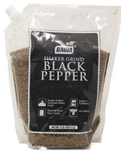
BLACK PEPPER COARSE GRIND - 02016 8/2 LBS