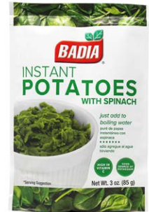
INSTANT POTATOES WITH SPINACH - 01266 6/3 OZ