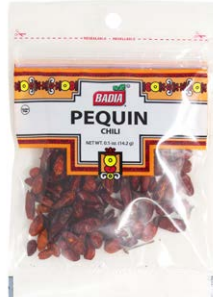
PEQUIN CHILI - 00654 12/0.5 OZ