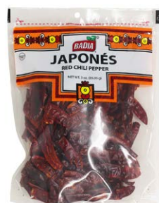
JAPONÉS (RED CHILI PEPPER) - 00067 12/3 OZ