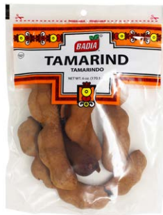
TAMARIND - 00661 12/6 OZ