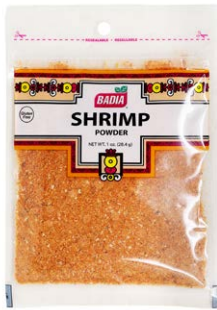
SHRIMP POWDER - 00286 12/1 OZ