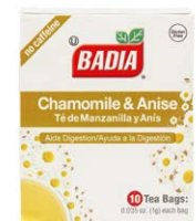
CHAMOMILE & ANISE - 00225 20/10 BAGS