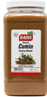
CUMIN GROUND - 00304 4/4 LBS