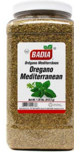
OREGANO WHOLE MEDITERRANEAN - 02073 4/1.35 LBS