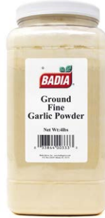
FINE GROUND GARLIC - 00333 4/4 LBS