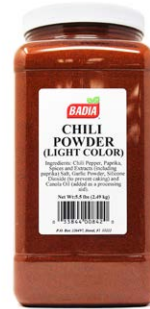
CHILI POWDER LIGHT COLOR - 00842 4/5.5 LBS