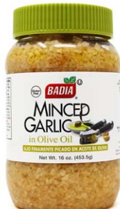
MINCED GARLIC IN OLIVE OIL - 00737 12/16 OZ