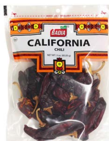
CALIFORNIA - 00642 12/3 OZ