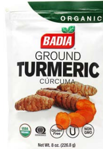
ORGANIC TURMERIC GROUND - 02129 8/8 OZ