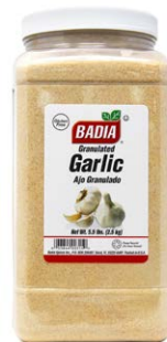
GARLIC GRANULATED - 00315 4/5.5 LBS