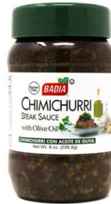
CHIMICHURRI SAUCE - 00405 12/8 OZ