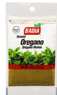
OREGANO GROUND - 00022 12/0.5 OZ