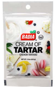
CREAM OF TARTAR - 00088 12/1.5 OZ