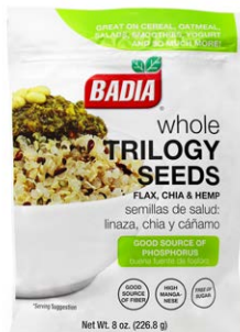
TRILOGY HEALTH SEEDS - 01210 8/8 OZ