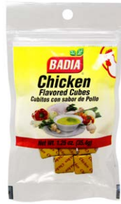
CHICKEN FLAVORED CUBES - 00077 12/1.25 OZ