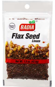
FLAXSEED - 00060 12/1.5 OZ