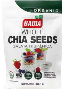
ORGANIC CHIA SEEDS - 01211 8/9 OZ