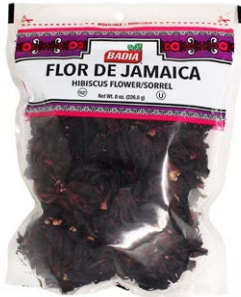
HIBISCUS FLOWER - 00644 12/8 OZ