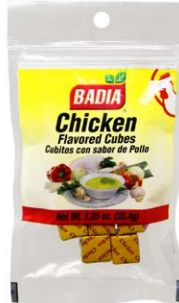
CHICKEN FLAVORED CUBES - 00077 12/1.25 OZ