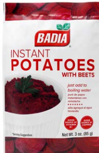
INSTANT POTATOES WITH BEETS - 01263