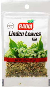
LINDEN LEAVES - 00033 12/0.25 OZ