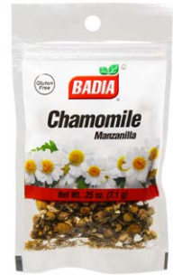
CHAMOMILE FLOWERS - 00034 12/0.25 OZ