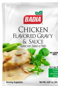
CHICKEN FLAVORED GRAVY - 00085