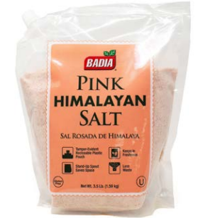
PINK HIMALAYAN SALT - 02130 8/3.5 LBS