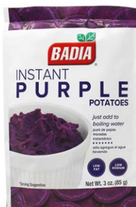
INSTANT PURPLE POTATOES - 01265