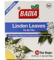
LINDEN LEAVES - 00211 20/10 BAGS