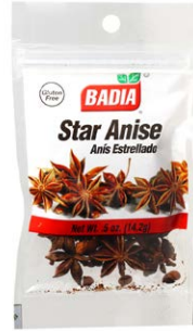
STAR ANISE - 00035 12/0.5 OZ