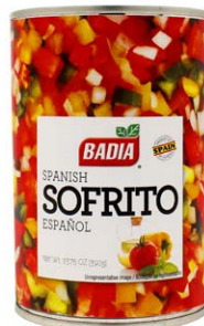
SPANISH SOFRITO - 00455 12/14.1 OZ