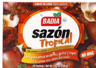
SAZON TROPICAL® WITH CORIANDER & ANNATTO - 00761 15/3.52 OZ