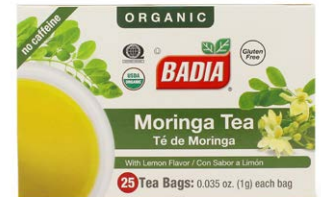
ORGANIC MORINGA WITH LEMON-00239 10/25 BAGS