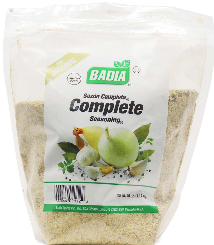
COMPLETE SEASONING® - 02112 6/40 OZ

Below you'll find a fine selection of key ingredients for your food preparations.