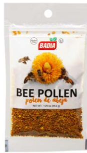
BEE POLLEN - 00082 12/1.25 OZ