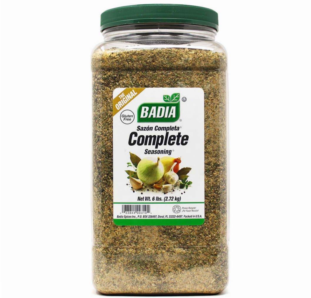
COMPLETE SEASONING® - 00310 4/6 LBS

These jars are filled with the ideal amount to enjoy our favorites, from basics in the kitchen to our proprietary blends.