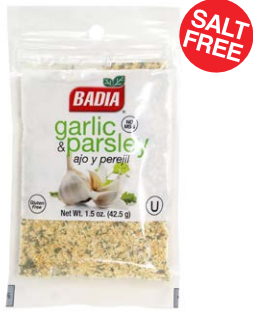
GARLIC & PARSLEY - 00076 12/1.5 OZ