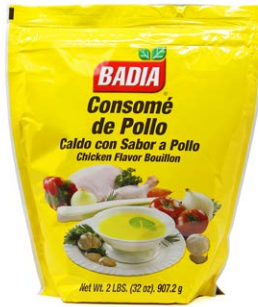
CHICKEN FLAVOR BOUILLON - 00934 8/2 LBS