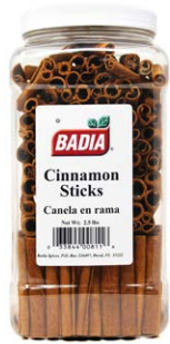
CINNAMON STICKS - 00811 4/2.5 LBS