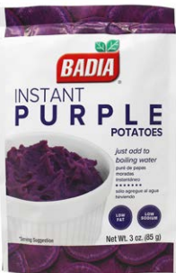
INSTANT PURPLE POTATOES - 01265 6/3 OZ