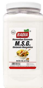
M.S.G. - 00308 4/6 LBS