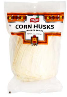
CORN HUSKS - 60645 6/6 OZ