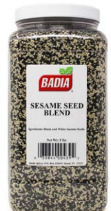
SESAME SEEDS 50/50 MIX HULLED & BLACK - 00439 4/5 LBS