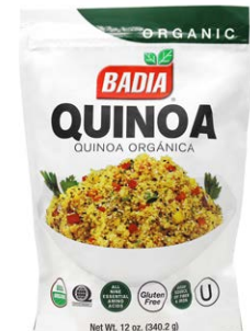
ORGANIC QUINOA - 00175 6/12 OZ