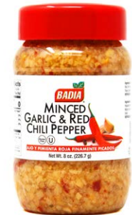
MINCED GARLIC & RED CHILI PEPPER - 00235 12/8 OZ