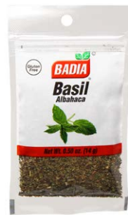
BASIL - 00072