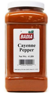
PEPPER RED CAYENNE - 02002 4/4 LBS