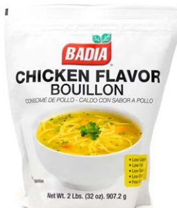
CHICKEN FLAVOR BOUILLON - 00092