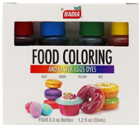
FOOD COLORING - 00422 12/1.2 FL OZ