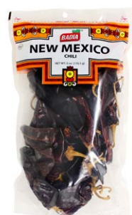
NEW MEXICO - 00686 12/6 OZ