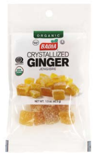
ORGANIC CRYSTALLIZED GINGER - 00083 12/1.5 OZ