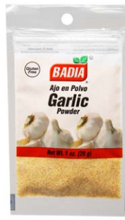
GARLIC POWDER - 00070 12/1 OZ