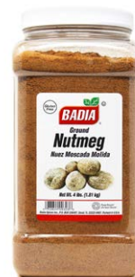
NUTMEG GROUND - 00303 4/4 LBS