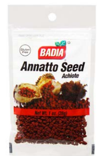
ANNATTO SEED - 00023