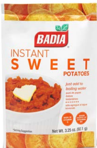
INSTANT SWEET POTATOES - 01267 6/3.25 OZ