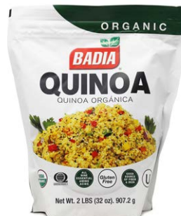
ORGANIC QUINOA - 00094 6/2 LBS