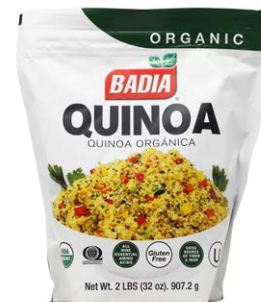
ORGANIC QUINOA - 00094