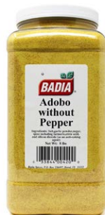
ADOBO WITHOUT PEPPER - 00420 4/8 LBS