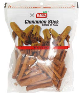
CINNAMON STICKS - 60302 6/12 OZ