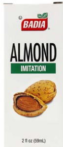
ALMOND EXTRACT - 00418 12/2 FL OZ