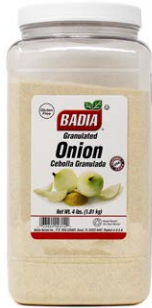
ONION GRANULATED - 00314 4/4 LBS