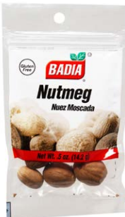
NUTMEG WHOLE - 00031 12/0.5 OZ