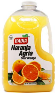
SOUR ORANGE - 00739 4/128 FL OZ