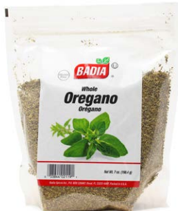
OREGANO WHOLE - 02119 6/7 OZ