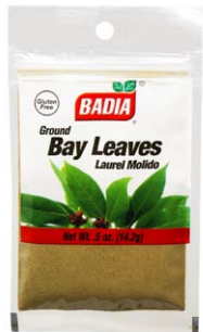
BAY LEAVES GROUND - 00020