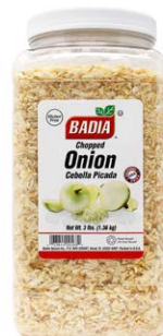
ONION FLAKES (CHOPPED) - 00568 4/3 LBS