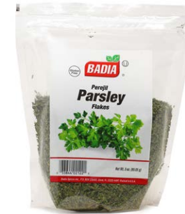
PARSLEY FLAKES - 02122 6/3 OZ