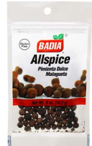
ALLSPICE WHOLE - 00040

The one that started it all. The perfect combination of ingredients and spices, carefully chosen to enhance the natural flavor of your favorite food.