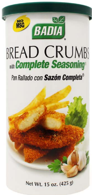
BREAD CRUMBS - 00270 12/15 OZ

A fine selection of key products to create delightful dishes for every occasion.