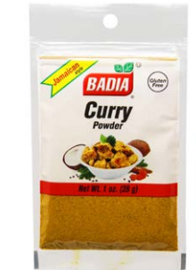
CURRY POWDER - 00074 12/1 OZ