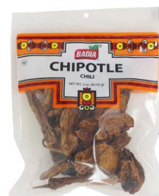
CHIPOTLE - 00703 12/3 OZ