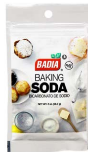
BAKING SODA - 00087