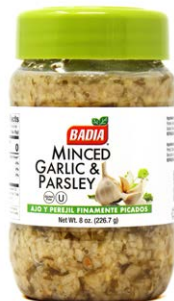
MINCED GARLIC & PARSLEY - 00234 12/8 OZ