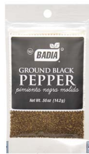
PEPPER GROUND BLACK - 00024 12/0.5 OZ