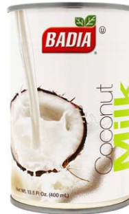
COCONUT MILK - 12261 12/13.5 FL OZ