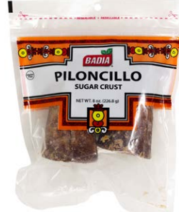
PILONCILLO (SUGAR CRUST) - 00665 12/8 OZ