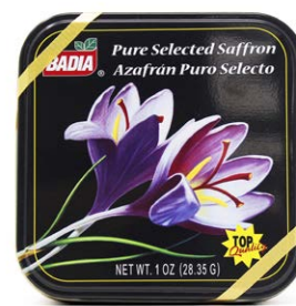
PURE SELECTED SAFFRON CAN - 00769 1/1 OZ