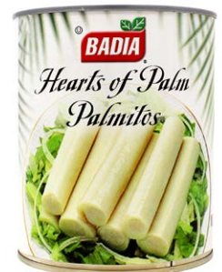
HEARTS OF PALM - 00450 12/28 OZ