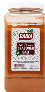
SEASONED SALT - 00600 4/7 LBS