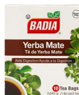
YERBA MATE - 00768 20/10 BAGS