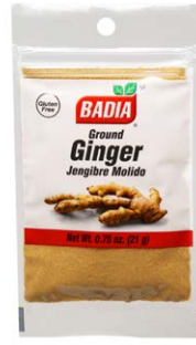
GINGER GROUND - 00075 12/0.75 OZ