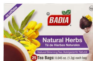
NATURAL HERBS - 00792 10/25 BAGS