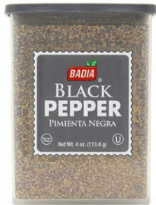
BLACK PEPPER CAN - 00407 12/4 OZ

Conveniently spice up your favorite dishes with our cans & grinders!