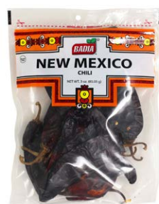
NEW MEXICO - 00640 12/3 OZ