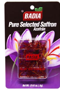
SAFFRON SPANISH - 00055 12/0.4 GM