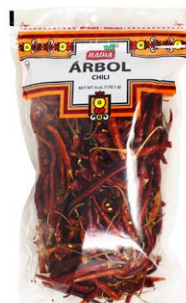
ARBOL - 00683 12/6 OZ