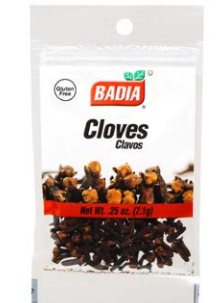
CLOVES - 00037 12/0.25 OZ