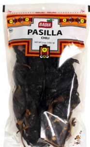
PASILLA (NEGRO LARGO) - 00685 12/6 OZ