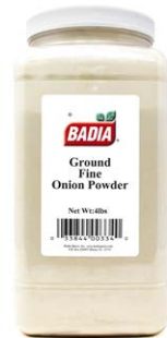
FINE GROUND ONION - 00334 4/4 LBS