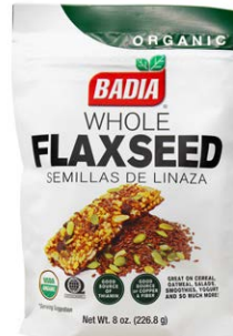
ORGANIC FLAXSEED - 01206 8/8 OZ