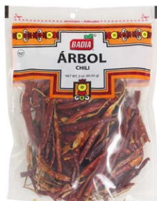
ARBOL - 00641 12/3 OZ