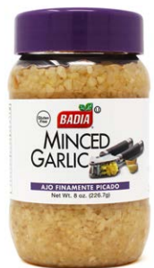
MINCED GARLIC IN WATER - 00335 12/8 OZ