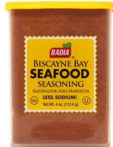
BISCAYNE BAY SEASONING CAN - 00397 12/4 OZ