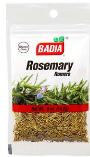
ROSEMARY - 00058 12/0.5 OZ