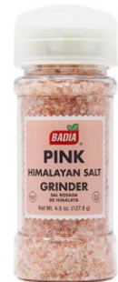
PINK HIMALAYAN SALT GRINDER - 80491