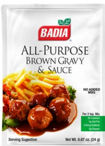
BROWN GRAVY - 00091