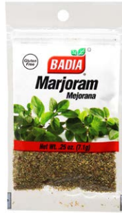
MARJORAM - 00057 12/0.25 OZ