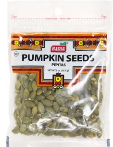
PUMPKIN SEED (PEPITAS) - 00656 12/2 OZ