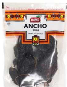
ANCHO - 00716 12/3 OZ

Browse our selection and find everything you need for a real Mexican meal.