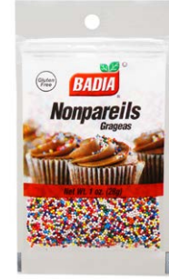
NONPAREILS - 00042 12/1 OZ