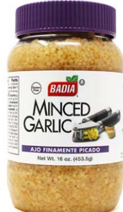
MINCED GARLIC IN WATER - 00340 12/16 OZ