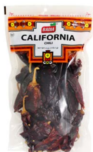
CALIFORNIA - 00684 12/6 OZ