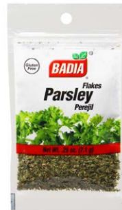
PARSLEY FLAKES - 00041 12/0.25 OZ