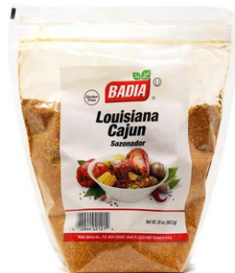
CAJUN SEASONING - 02121 6/35 OZ