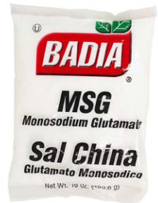
M.S.G. - 00500 6/1.75 LBS