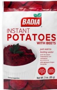
INSTANT POTATOES WITH BEETS - 01263 6/3 OZ