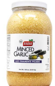
MINCED GARLIC IN WATER - 00348 4/128 OZ