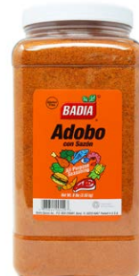
ADOBO WITH SAZÓN - 00429 4/8 LBS