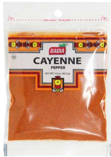
CAYENNE GROUND - 00280 12/1.5 OZ