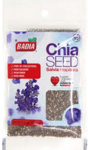
CHIA SEED - 00045 12/1.5 OZ