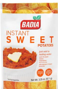
INSTANT SWEET POTATOES - 01267