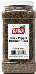
PEPPER BLACK BUTCHER BLOCK - 00814 4/4 LBS