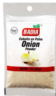
ONION POWDER - 00073 12/1 OZ