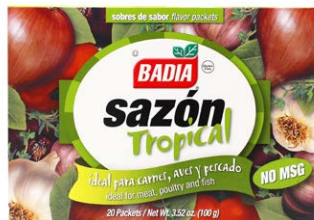
SAZON TROPICAL® - 00758 15/3.52 OZ