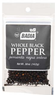
PEPPER WHOLE BLACK - 00025 12/0.5 OZ