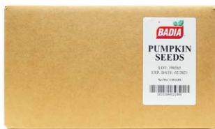
PUMPKIN SEEDS - 02086 1/10 LBS