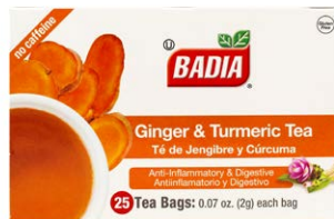
GINGER & TURMERIC - 00205 10/25 BAGS