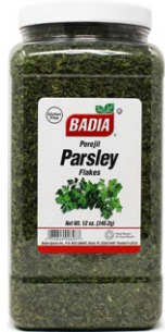
PARSLEY FLAKES - 00603 4/12 OZ