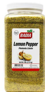
LEMON PEPPER - 00764 4/6 LBS