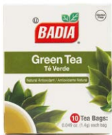
GREEN TEA - 00710 20/10 BAGS