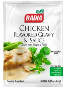
CHICKEN FLAVORED GRAVY - 00085 COMING SOON