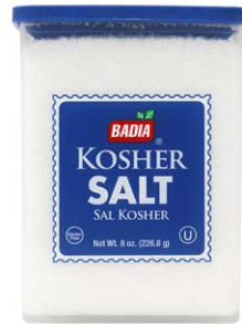
KOSHER SALT CAN - 00398 12/8 OZ