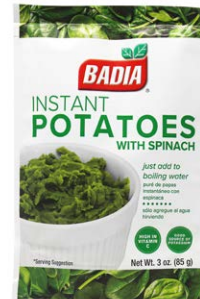
INSTANT POTATOES WITH SPINACH - 01266