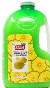
LEMON JUICE - 00408 4/128 FL OZ