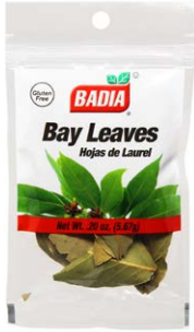
BAY LEAVES WHOLE - 00019 12/0.2 OZ