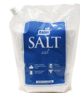
SALT - 00521 8/5 LBS