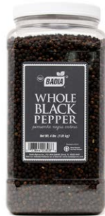
PEPPER BLACK WHOLE - 00808 4/4 LBS