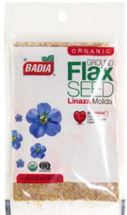
ORGANIC FLAXSEED GROUND - 00043 12/1.25 OZ