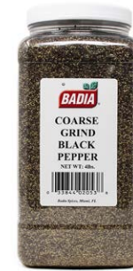
PEPPER BLACK COARSE GRIND - 02053 4/4 LBS