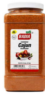
CAJUN SEASONING - 00809 4/5.5 LBS