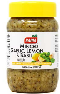
MINCED GARLIC, LEMON & BASIL - 00236 12/8 OZ