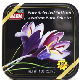
PURE SELECTED SAFFRON CAN - 00769 1/1 OZ