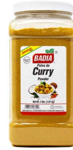
CURRY POWDER - 00602 4/4 LBS