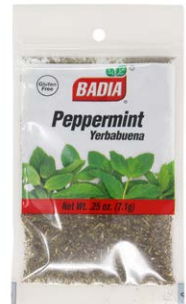
PEPPERMINT - 00059 12/0.25 OZ