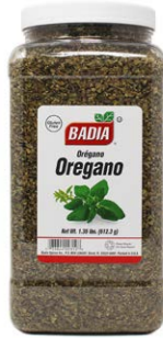
OREGANO WHOLE - 00312 4/1.35 LBS