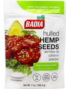
HULLED HEMP SEEDS - 01213 8/7 OZ