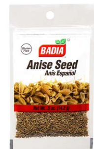
ANISE SEED - 00028