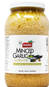
MINCED GARLIC IN OLIVE OIL - 00423 4/128 OZ