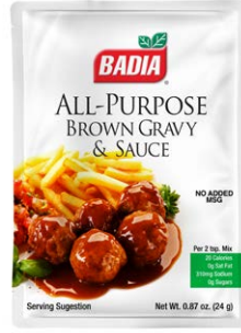
BROWN GRAVY - 00091 COMING SOON