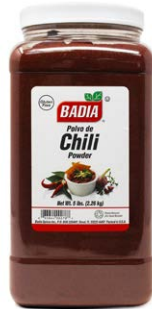
CHILI POWDER - 00278 4/5 LBS