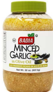
MINCED GARLIC IN OLIVE OIL - 00421 6/32 OZ