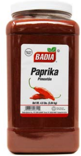
PAPRIKA - 00311 4/4.5 LBS