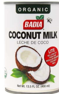
ORGANIC COCONUT MILK LITE - 00556 12/13.5 FL OZ