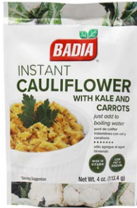
INSTANT CAULIFLOWER WITH KALE & CARROTS - 01264 6/4 OZ