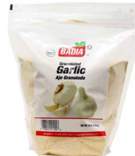
GARLIC GRANULATED - 02115 6/36 OZ