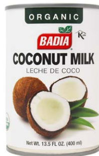
ORGANIC COCONUT MILK - 00555 12/13.5 FL OZ