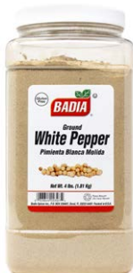
PEPPER WHITE GROUND - 00307 4/4 LBS