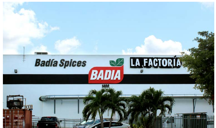
"LA FACTORÍA" PRODUCTION BUILDING