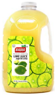
LIME JUICE - 00411 4/128 FL OZ