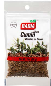
CUMIN SEED - 00018 12/1 OZ