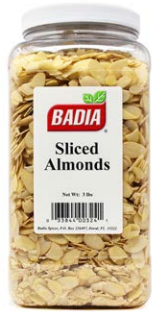
ALMONDS SLICED & BLANCHED - 00324 4/3 LBS