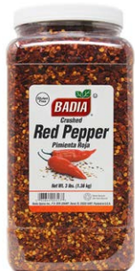
PEPPER RED CRUSHED - 00317 4/4 LBS