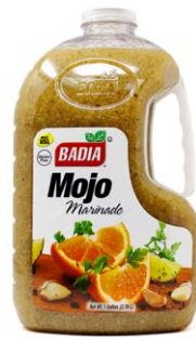
MOJO MARINADE - 00415 4/128 FL OZ