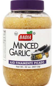
MINCED GARLIC IN WATER - 00345 6/32 OZ