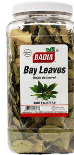
BAY LEAVES - 00313 4/6 OZ