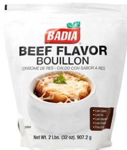
BEEF FLAVOR BOUILLON - 00095 8/2 LBS

The one that started it all, has the perfect combination of ingredients and spices, carefully chosen to enhance the natural flavor of your favorite food.