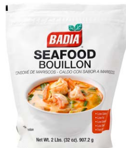
SEAFOOD BOUILLON - 00100