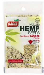
HULLED HEMP SEEDS - 00081 12/1.25 OZ