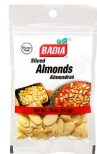
ALMONDS SLICED - 00036