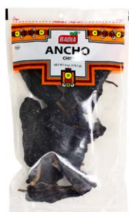
ANCHO - 00707 12/6 OZ