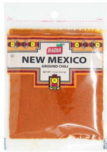
NEW MEXICO GROUND - 00648 12/1.5 OZ