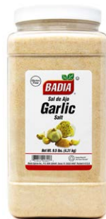
GARLIC SALT - 00801 4/9.5 LBS