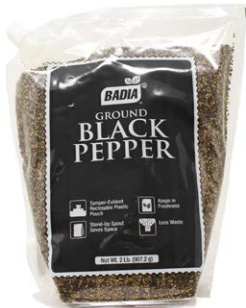
BLACK PEPPER GROUND - 02015 8/2 LBS