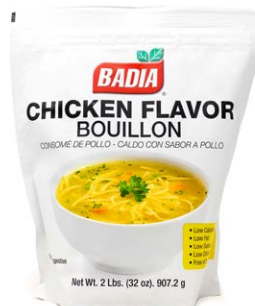
CHICKEN FLAVOR BOUILLON - 00092 8/2 LBS