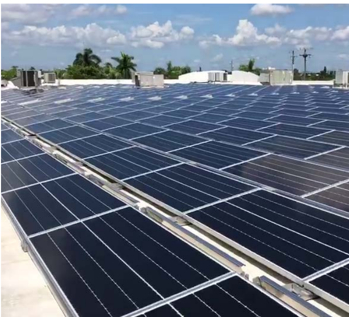
SOLAR PANELS DISTRIBUTION CENTER BUILDING

Badia is committed to the continuous improvement and the initiative of programs with our suppliers to meet the goals set out by the United Nations and its sustainability initiatives.