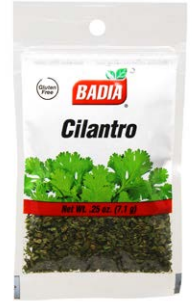
CILANTRO - 00061 12/0.25 OZ