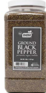
PEPPER BLACK GROUND - 00306 4/4 LBS