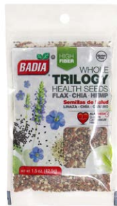
TRIOLOGY HEALTH SEEDS - 00080 12/1.5 OZ