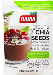
CHIA SEEDS GROUND - 01223 8/6 OZ