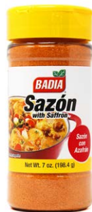
SAZÓN WITH SAFFRON - 60138 6/7 OZ