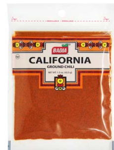
CALIFORNIA GROUND - 00647 12/1.5 OZ