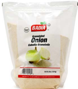
ONION GRANULATED - 02116 6/36 OZ