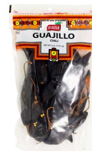
GUAJILLO CHILE - 00682 12/6 OZ