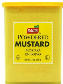
POWDERED MUSTARD CAN - 00262 12/3 OZ