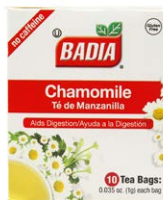
CHAMOMILE - 00210 20/10 BAGS