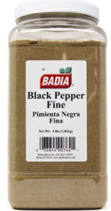
PEPPER BLACK GROUND FINE - 00762 4/4 LBS