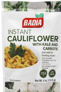
INSTANT CAULIFLOWER WITH KALE & CARROTS - 01264