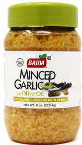
MINCED GARLIC IN OLIVE OIL - 00220 12/8 OZ