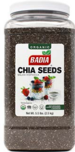
ORGANIC CHIA SEEDS - 20519 2/5.5 LBS