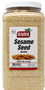
SESAME SEEDS (HULLED) - 00799 4/5 LBS