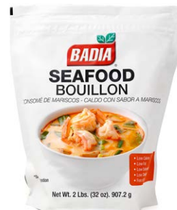
SEAFOOD BOUILLON - 00100 8/2 LBS