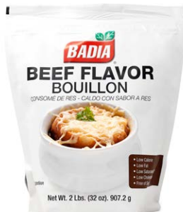
BEEF FLAVOR BOUILLON - 00095