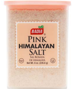
PINK HIMALAYAN SALT CAN - 00399 12/8 OZ