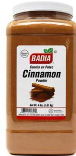
CINNAMON POWDER - 00301 4/4 LBS