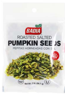
ROASTED SALTED PUMPKIN SEEDS-00738 12/2 OZ