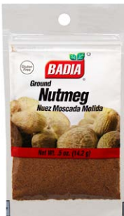
NUTMEG GROUND - 00032 12/0.5 OZ