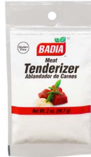
MEAT TENDERIZER - 00071 12/2 OZ