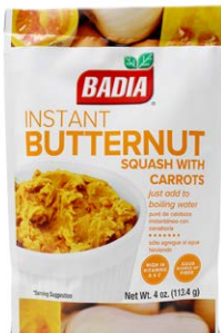
INSTANT BUTTERNUT SQUASH WITH CARROTS - 01262

Complement your everyday meals with these beautiful and tasty side dishes. From Instant Potatoes & Vegetables, to flavorful Bouillons and delicious Organic Quinoa.