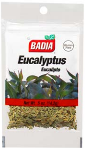
EUCALYPTUS - 00062 12/0.5 OZ