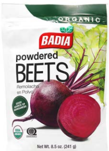
ORGANIC POWDERED BEETS - 02126 8/8.5 OZ