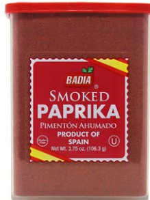
SMOKED PAPRIKA CAN - 00400 12/3.75 OZ