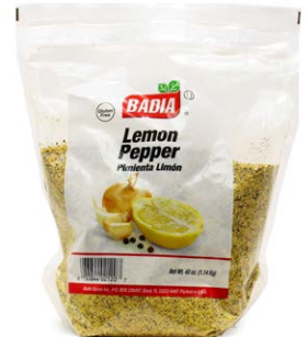
LEMON PEPPER - 02120 6/40 OZ