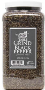
PEPPER BLACK TABLEGRIND - 00813 4/4 LBS