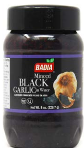
MINCED BLACK GARLIC IN WATER - 61221 6/8 OZ