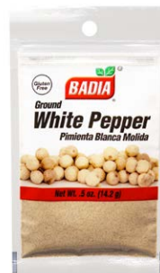
PEPPER GROUND WHITE - 00026 12/0.5 OZ