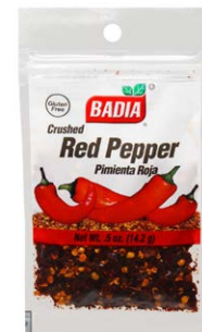
PEPPER CRUSHED RED - 00039 12/0.5 OZ