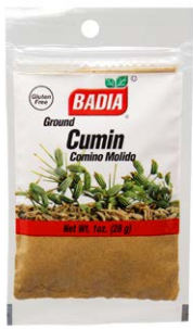
CUMIN GROUND - 00017 12/1 OZ