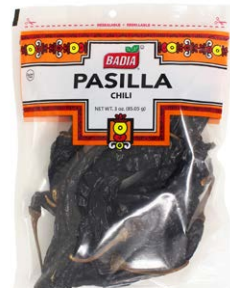
PASILLA (NEGRO LARGO) - 00066 12/3 OZ