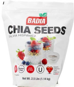
CHIA SEEDS - 02083 8/2.5 LBS