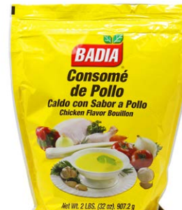
CHICKEN FLAVOR BOUILLON - 00934