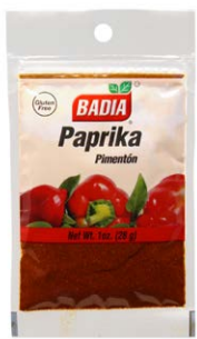
PAPRIKA - 00027 12/1 OZ