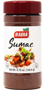
SUMAC - 60089 6/4.75