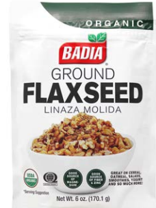
ORGANIC FLAXSEED GROUND - 01203 8/6 OZ