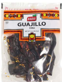
GUAJILLO - 00643 12/3 OZ