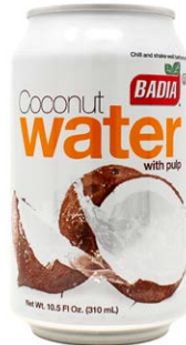
COCONUT WATER - 12240 12/10.5 FL OZ

Use as a beverage or as an ingredient for an incredible curry, puddings, cakes, flans, sauces and all your favorite dishes!