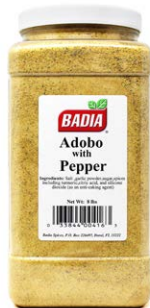
ADOBO WITH PEPPER - 00416 4/8 LBS

The one that started it all, has the perfect combination of ingredients and spices, carefully chosen to enhance the natural flavor of your favorite food.