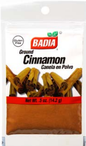
CINNAMON POWDER - 00030 12/0.5 OZ