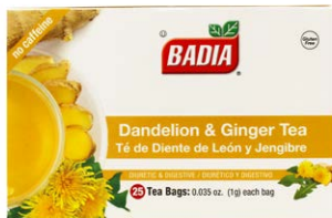
DANDELION & GINGER - 00238 10/25 BAGS