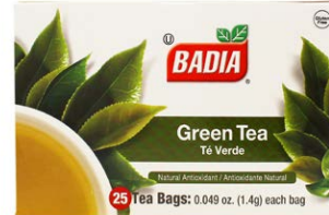
GREEN TEA - 00638 10/25 BAGS