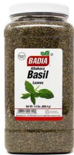
BASIL LEAVES - 00621 4/1.5 LBS