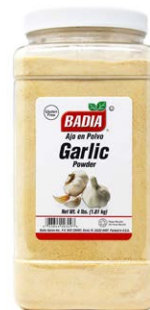
GARLIC POWDER - 00309 4/4 LBS