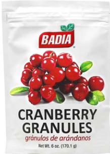
CRANBERRY GRANULES - 02127 8/6 OZ

Unique and flavorful ingredients for all your food needs!