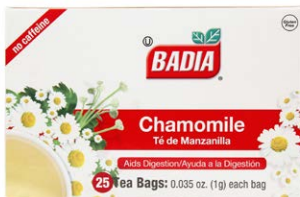
CHAMOMILE - 00790 10/25 BAGS