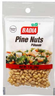
PINE NUTS - 00068 12/1.5 OZ