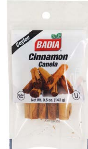
CINNAMON STICKS - 00029 12/0.5 OZ