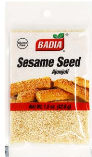
SESAME SEED HULLED - 00065 12/1.5 OZ