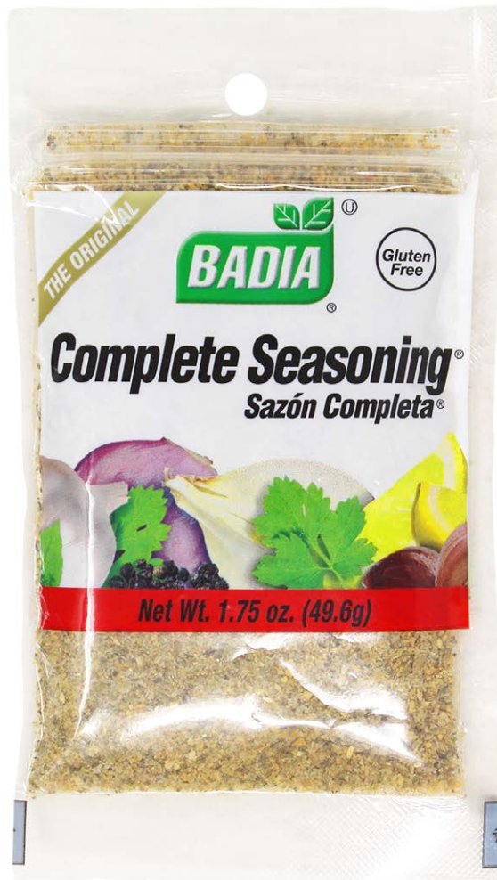
COMPLETE SEASONING® - 00099

This convenient and resealable size is the perfect one for the everyday needs while keeping the product fresh.