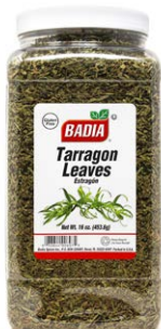
TARRAGON LEAVES - 00607 4/16 OZ