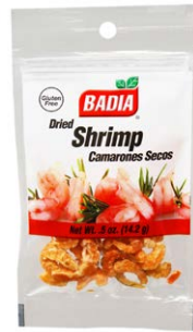
SHRIMP DRIED - 00038 12/0.5 OZ