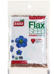
ORGANIC FLAXSEED WHOLE - 00053 12/1.5 OZ