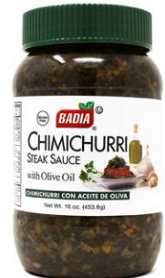
CHIMICHURRI SAUCE - 00936 12/16 OZ