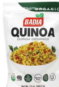
ORGANIC QUINOA - 00175