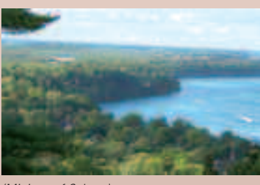
(Ministry of Culture)

Below is an example of a provincially and nationally significant cultural heritage landscape evaluated for its context and character. Views from the Brock Monument near Niagara-on-the-Lake are considered to be heritage attributes .