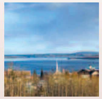
(Ministry of Culture)

A cultural heritage landscape may be scenic and contain notable natural features, but is primarily important for its signifi cant historical associations.