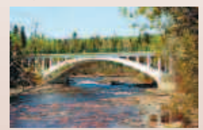
(Ministry of Culture)

Structures, such as a water tower, bridge, fence, or dam