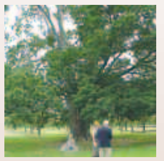
(Ministry of Culture)

A natural feature with cultural association, such as specimen trees or plantings being part of a larger cultural heritage landscape .