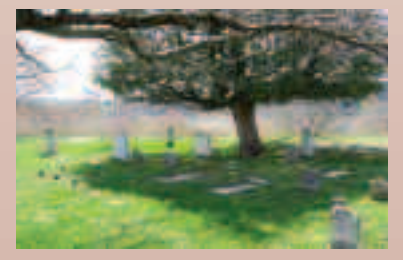
(Ministry of Culture)