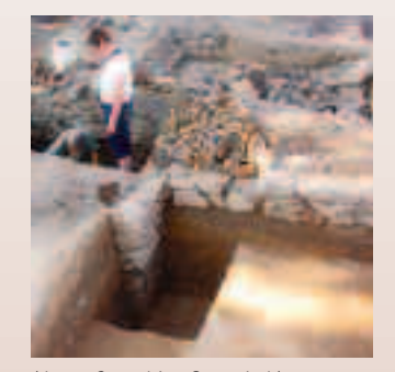
(Jones Consulting Group Ltd.)

Examples of significant archaeo-logical resources can include, but are not limited to, aboriginal villages, seasonal camps, spiritual sites and landscapes, lithic scatters, ossuaries, shipwrecks, military site(s), European settlement(s) and other evidence of occupation.