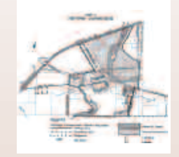
(City of Cambridge)

An example where boundaries were delineated and landscape elements were identified is the Blair heritage conservation district in the City of Cambridge.