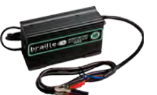
16325L 16V 25 AMP