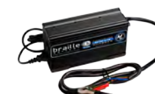
12325L 25 AMP