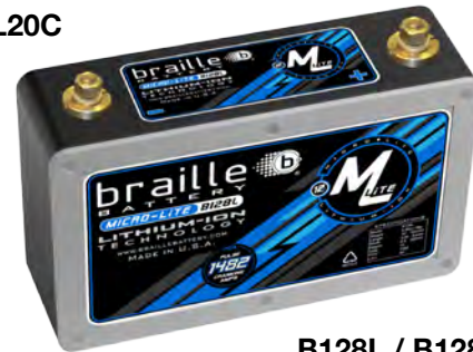
B128L / B128L-M6