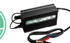
1636L 16V 6 AMP