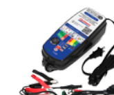
10 Amp 12v