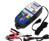
6 Amp 12v